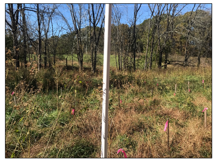
Vegetation Plot 1 (11/04/2020)