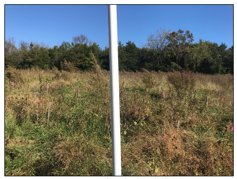
Vegetation Plot 2 (11/04/2020)