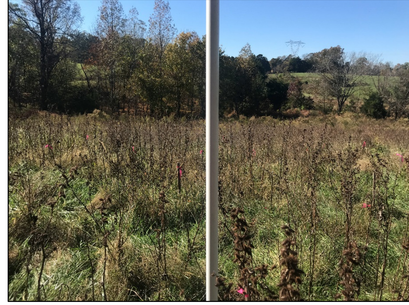
Vegetation Plot 4 (11/04/2020)