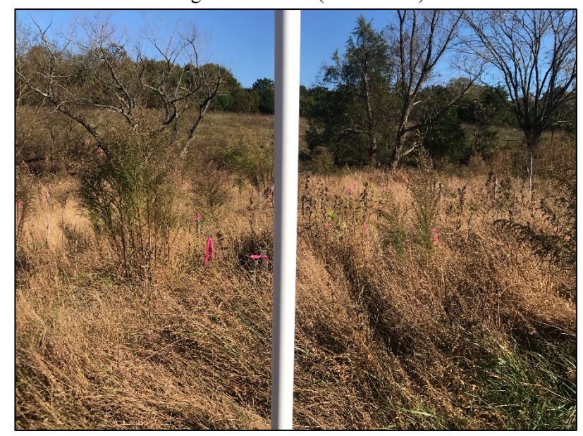
Vegetation Plot 3 (11/04/2020)