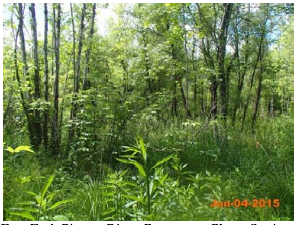
East Fork Pigeon River-Permanent Photo Station 8 South/Southeast