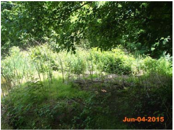
East Fork Pigeon River-Permanent Photo Station 18 North/Northeast