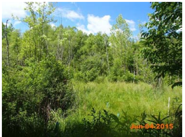
East Fork Pigeon River-Permanent Photo Station 9 Southwest