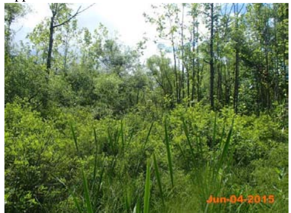
East Fork Pigeon River-Permanent Photo Station 7 East