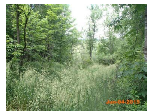
East Fork Pigeon River-Permanent Photo Station 20 North