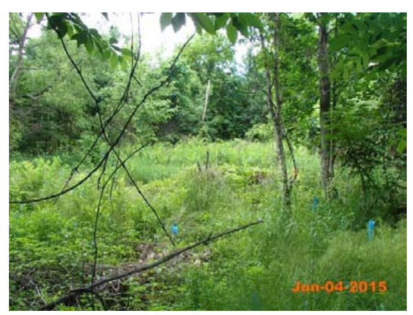
East Fork Pigeon River-Permanent Photo Station 19 South/Southwest