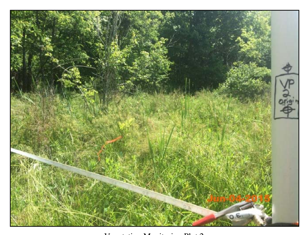
Vegetation Monitoring Plot 2 Monitoring Year 2 – June 4, 2015