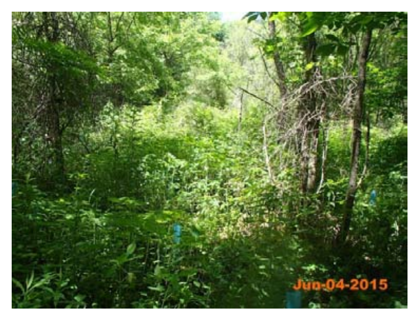
East Fork Pigeon River-Permanent Photo Station 4 North