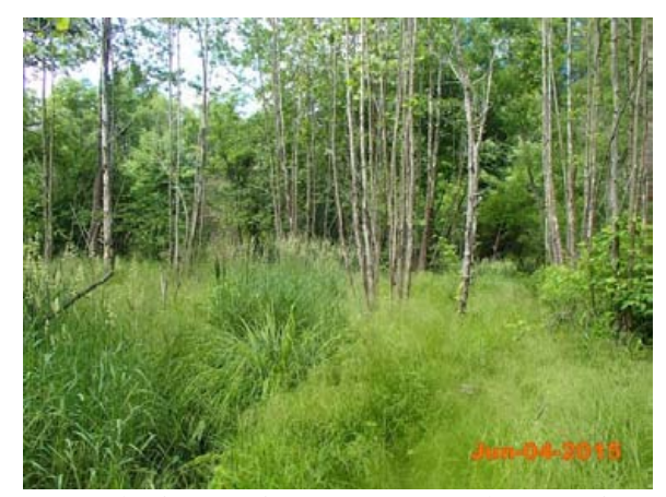
East Fork Pigeon River-Permanent Photo Station 6 Southwest