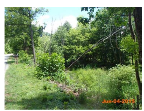
East Fork Pigeon River-Permanent Photo Station 11 Southeast