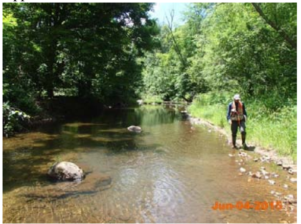
East Fork Pigeon River-Permanent Photo Station 13 Upstream