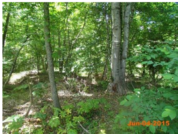
East Fork Pigeon River-Permanent Photo Station 12 East