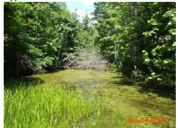
East Fork Pigeon River-Permanent Photo Station 17 Northwest