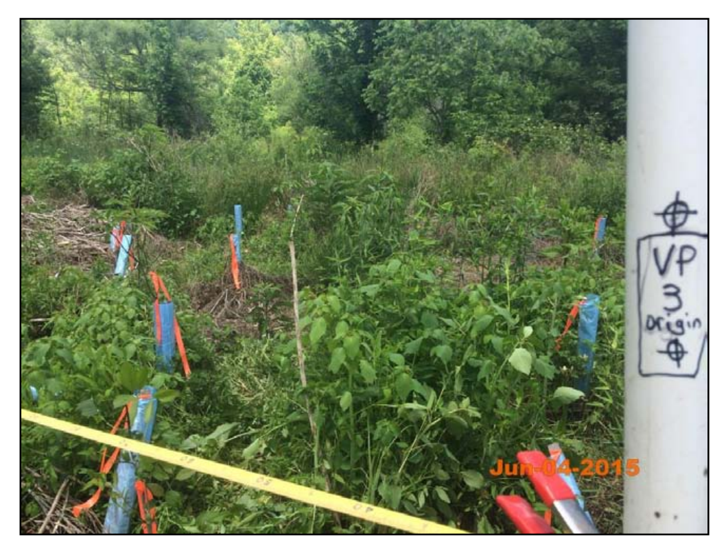
Vegetation Monitoring Plot 3 Monitoring Year 2 – June 4, 2015