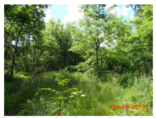
East Fork Pigeon River-Permanent Photo Station 3 North