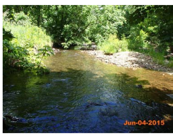
East Fork Pigeon River-Permanent Photo Station 5 Upstream