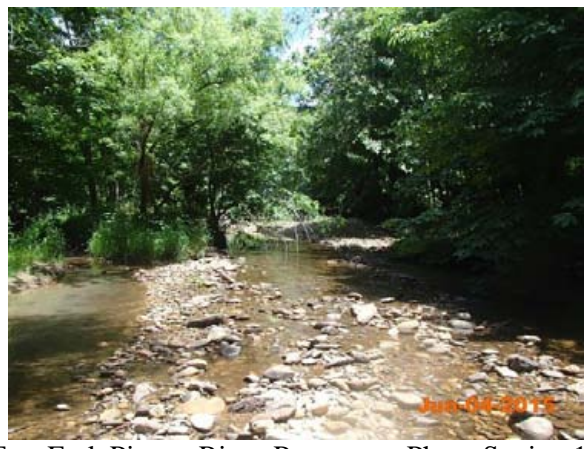
East Fork Pigeon River-Permanent Photo Station 13 Downstream