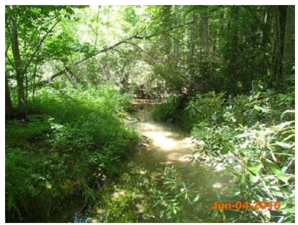
East Fork Pigeon River-Permanent Photo Station 2 West