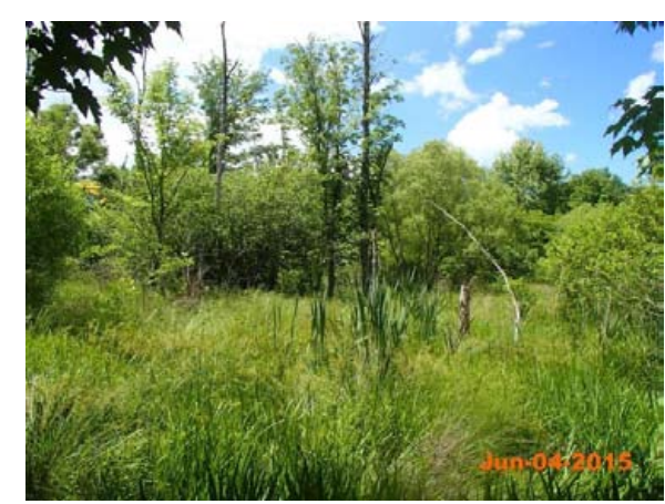
East Fork Pigeon River-Permanent Photo Station 10 South/Southwest