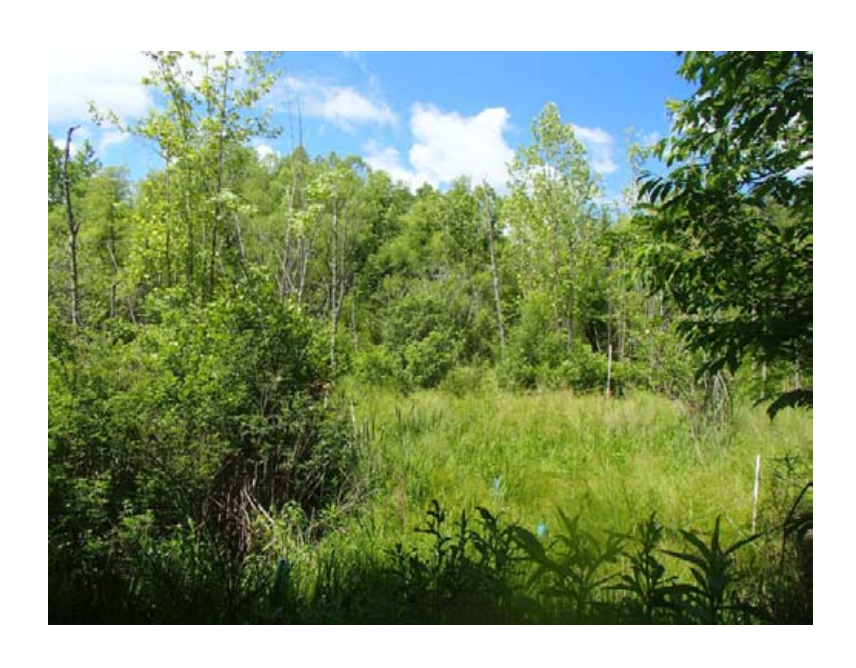
Submitted to: North Carolina Division of Mitigation Services North Carolina Department of Environmental Quality