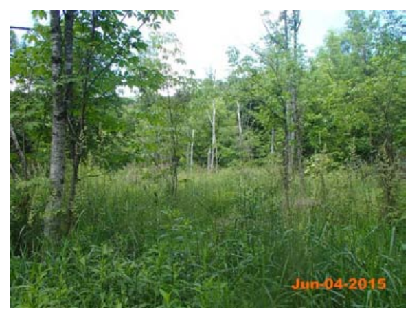
East Fork Pigeon River-Permanent Photo Station 15 North