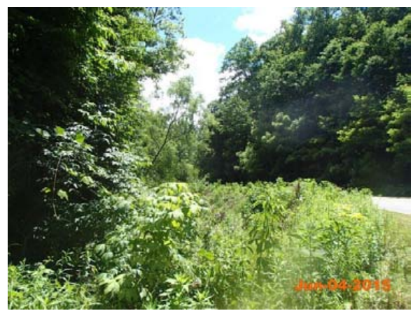
East Fork Pigeon River-Permanent Photo Station 1 East/Southeast