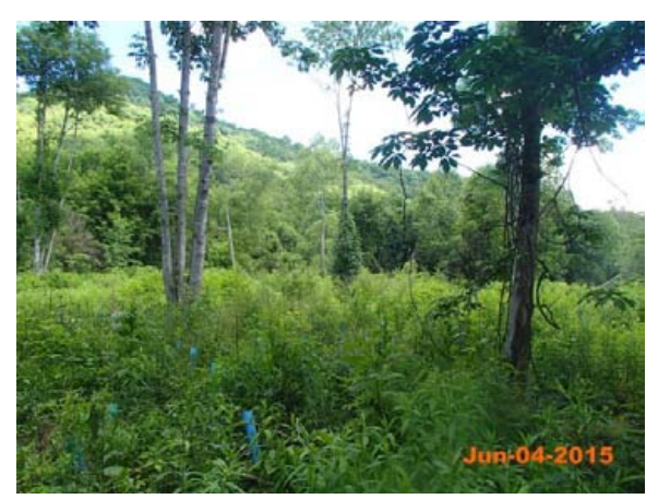
East Fork Pigeon River-Permanent Photo Station 14 East/Southeast