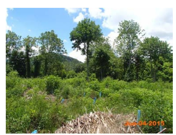
East Fork Pigeon River-Permanent Photo Station 16 West