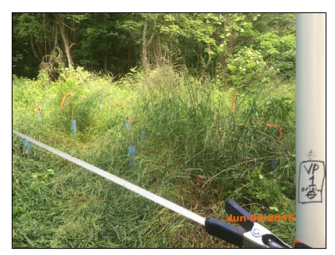
Vegetation Monitoring Plot 1 Monitoring Year 2 – June 4, 2015