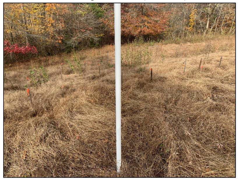
Vegetation Plot 4 (11/10/2020)