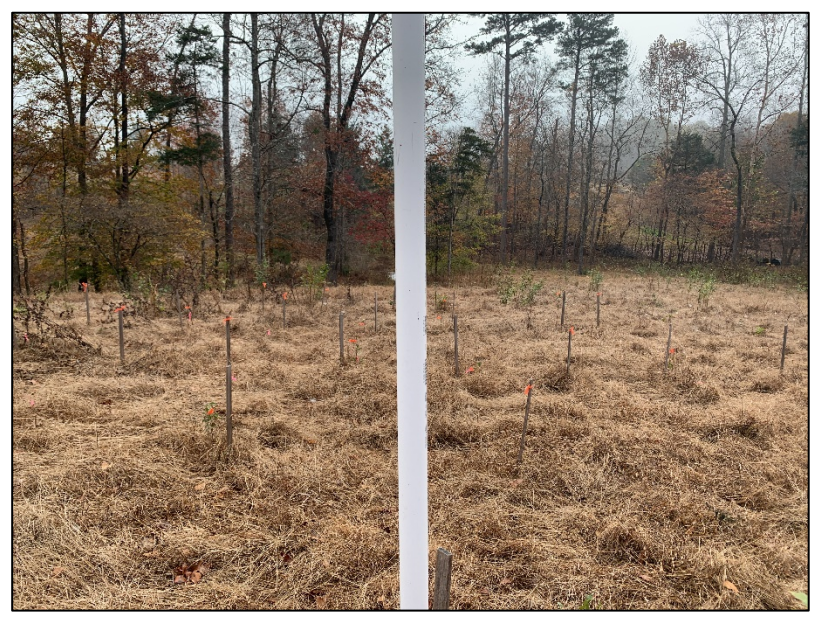
Vegetation Plot 2 (11/10/2020)