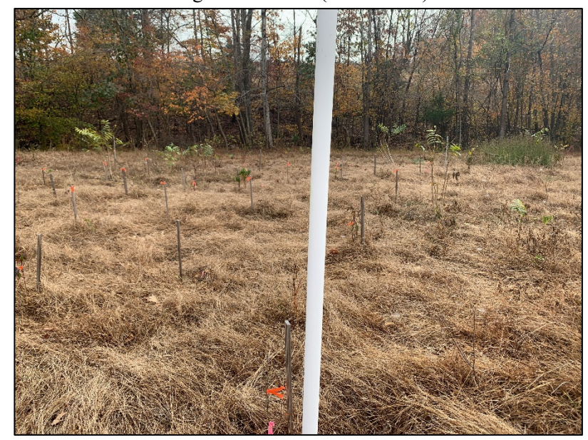
Vegetation Plot 3 (11/10/2020)