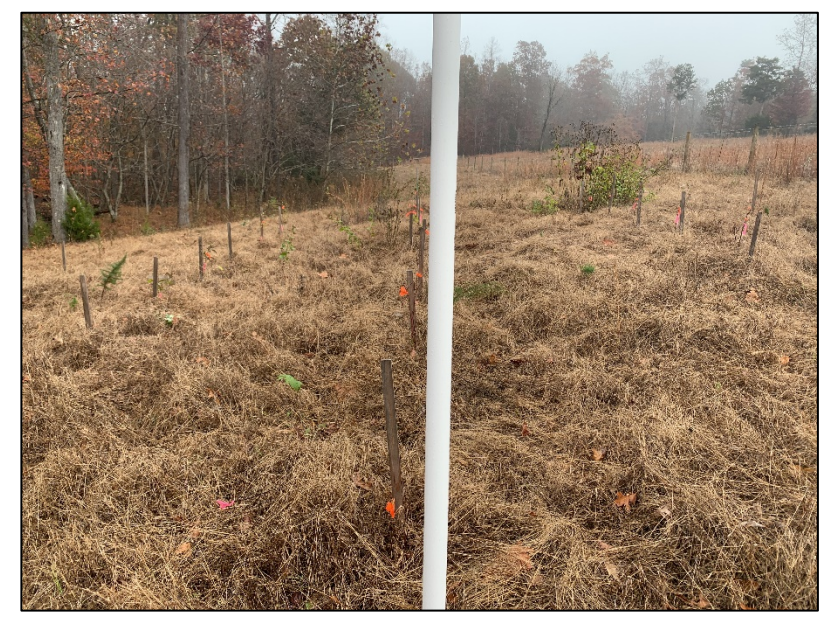
Vegetation Plot 1 (11/10/2020)