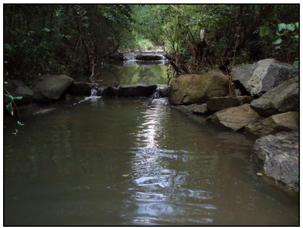
PA# 2 – Cross vane not functioning as intended. Sta. 14+40