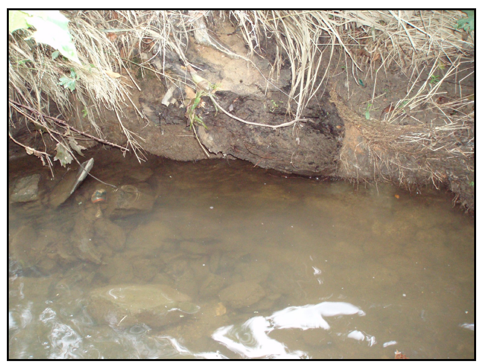
PA #7 – Left bank erosion/undercut; lack of rooted vegetation. Sta. 18+80