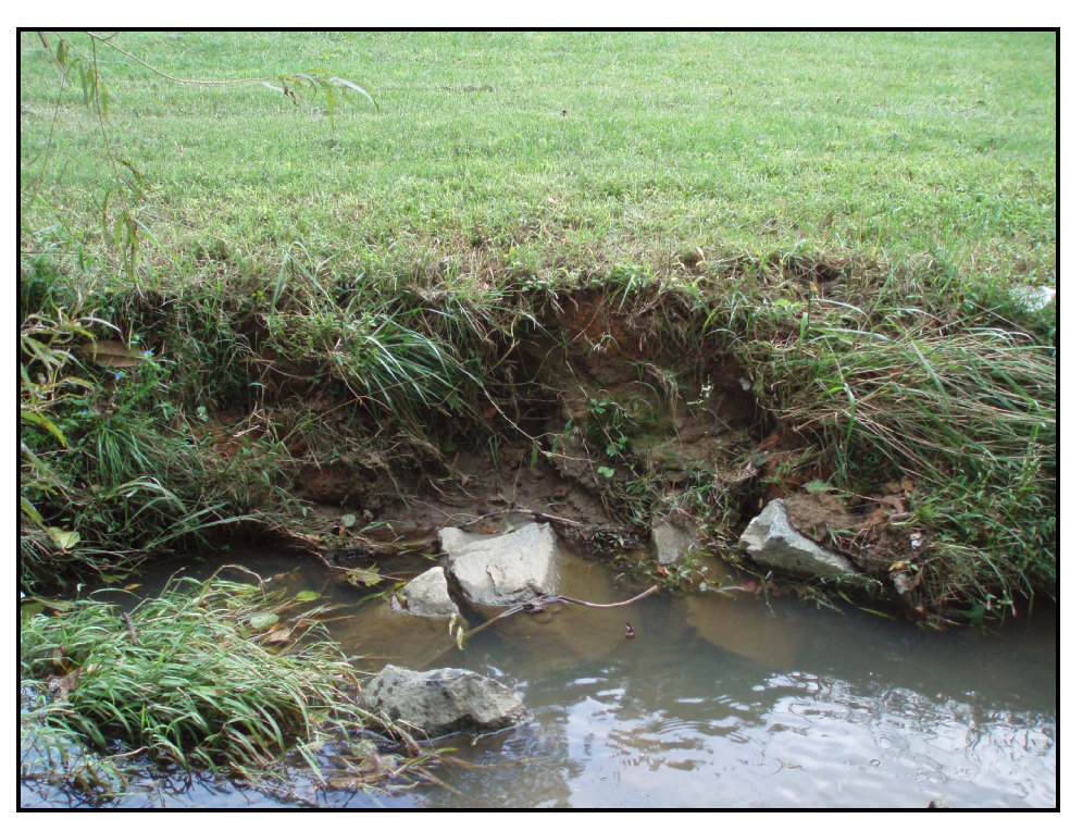
PA #8 – Left bank erosion; lack of rooted vegetation. Sta. 19+00