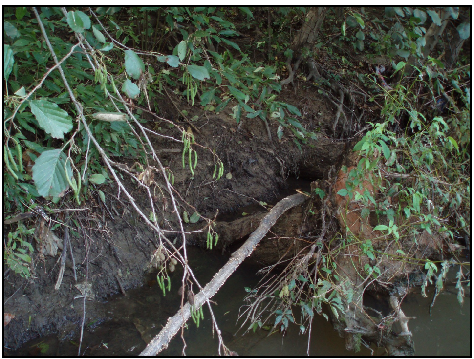
PA #5 – Right bank washed out behind root wad; improper installation. Sta. 17+40