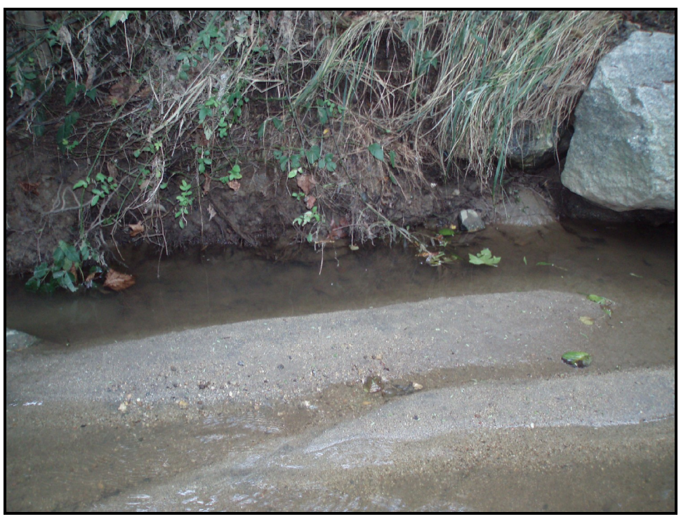
PA #6 – Right bank erosion; lack of rooted vegetation. Sta. 18+40