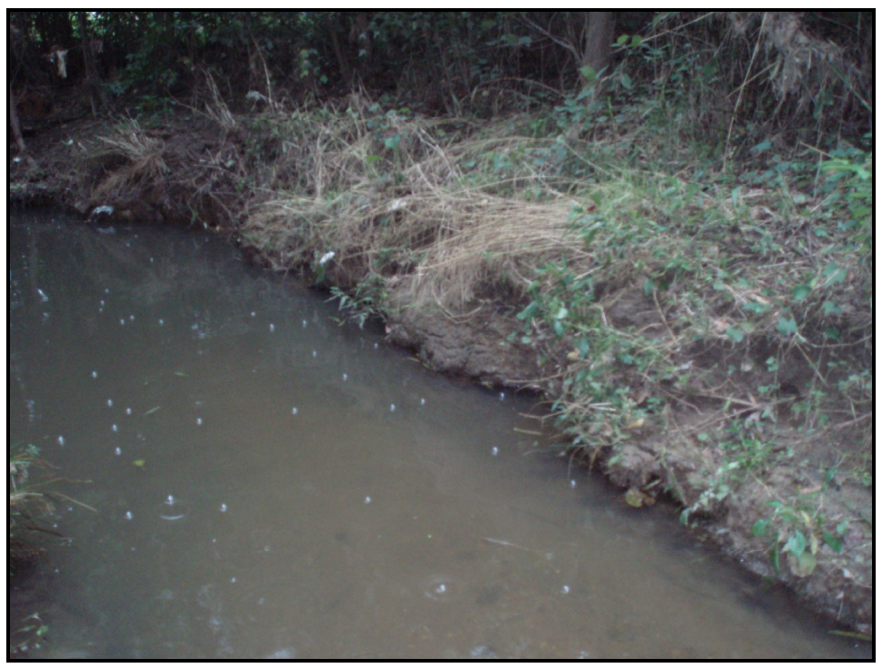
PA #10 – Right bank erosion; lack of rooted vegetation. Sta. 22+80 to 23+00