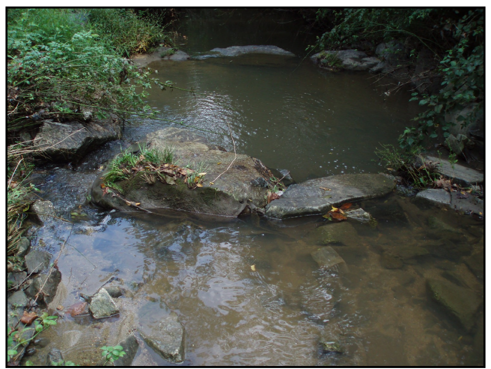
PA #1 – Header on cross vane set too high, water flowing around due to improper installation. Sta. 14+15