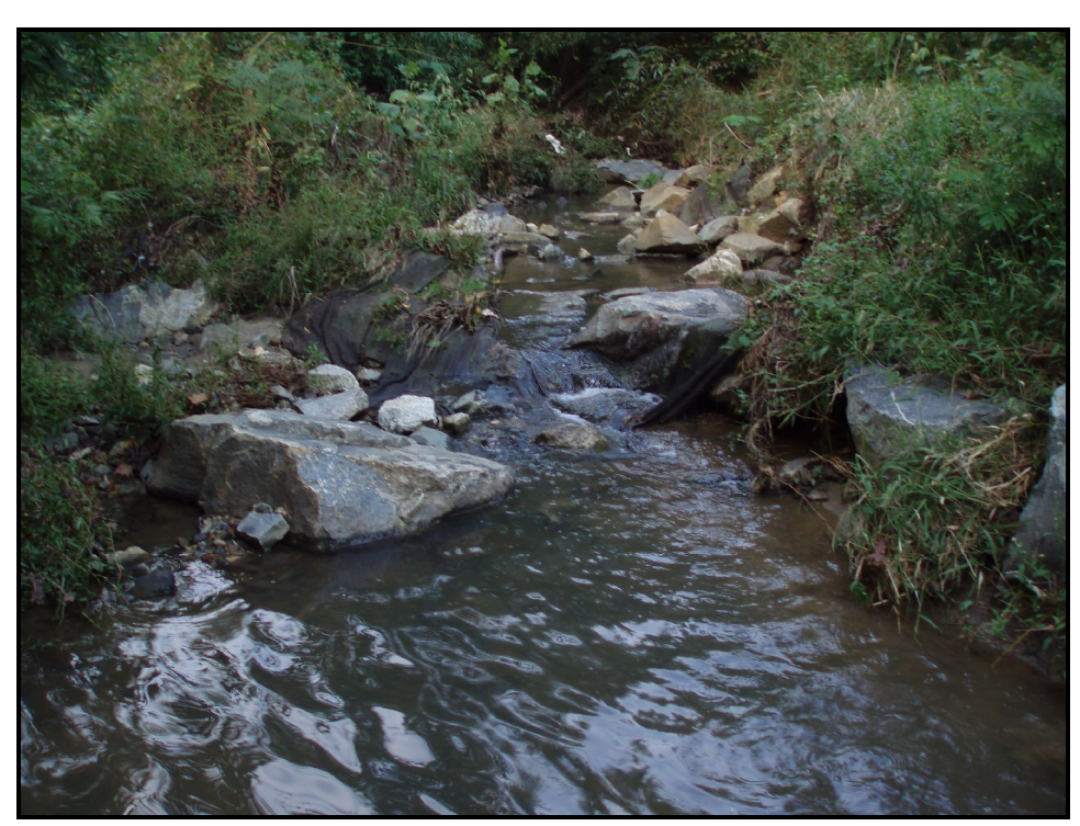
PA #4 – Header rock moved downstream from cross vane; improper installation. Sta. 16+90