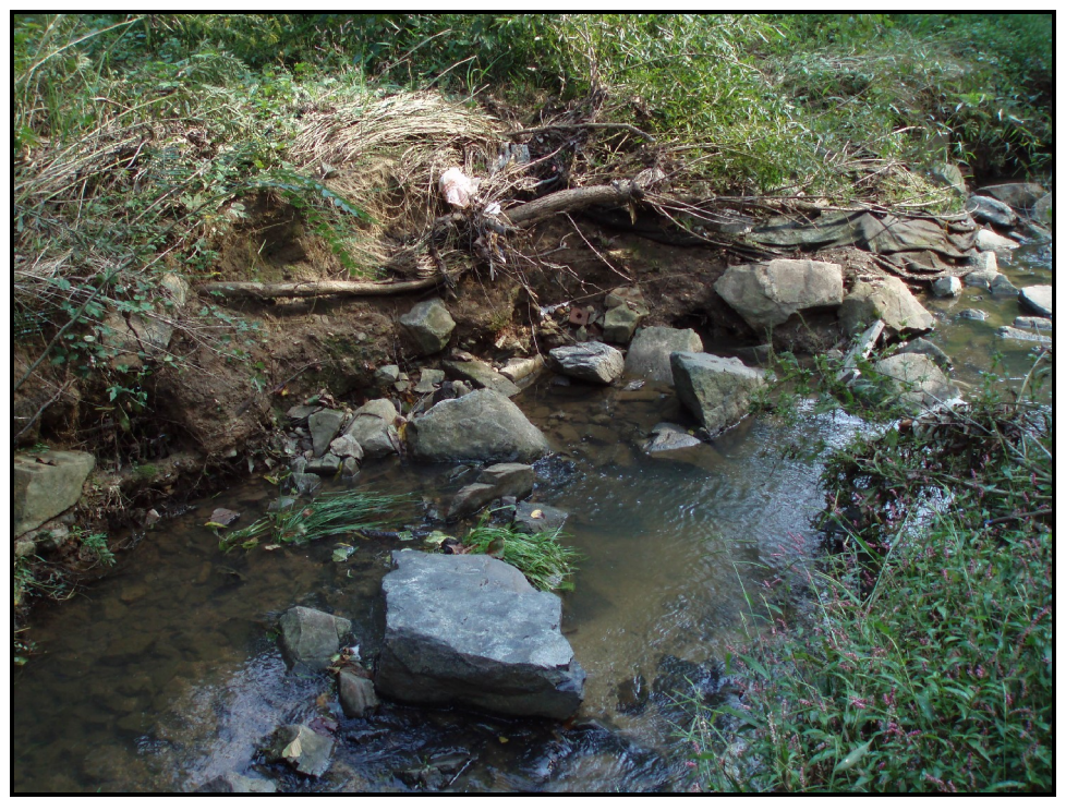
PA #3 – Left bank erosion; lack of rooted vegetation. Sta. 16+50