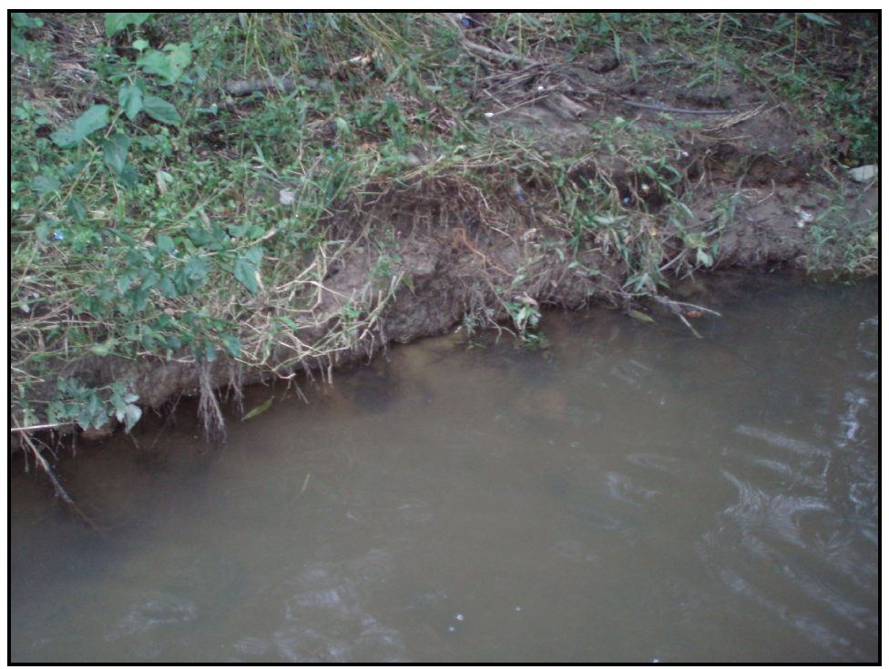
PA #9 – Minor left bank erosion; lack of rooted vegetation. Sta. 21+80