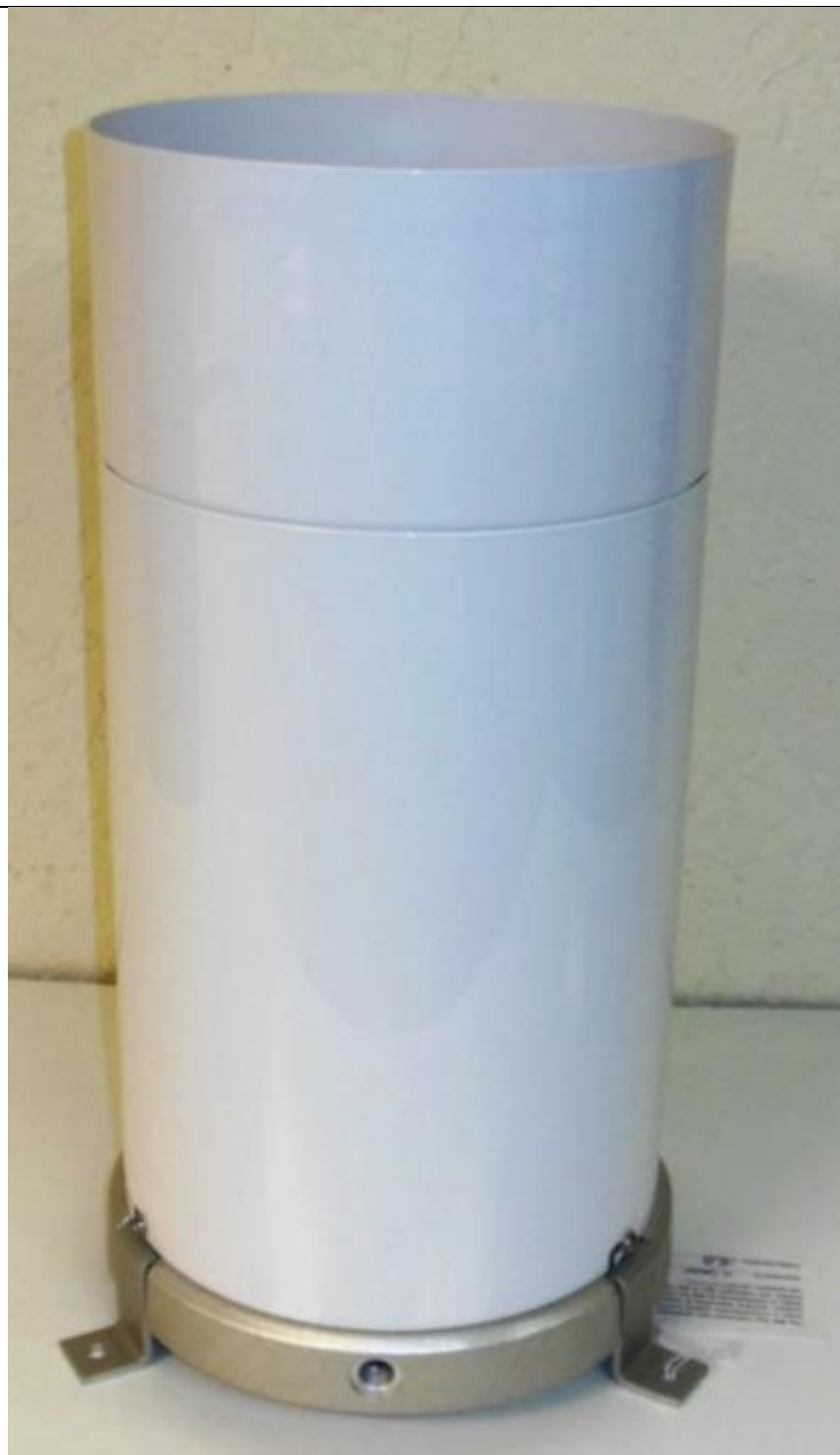
Figure 1 - MetOne 370D Rain Gauge