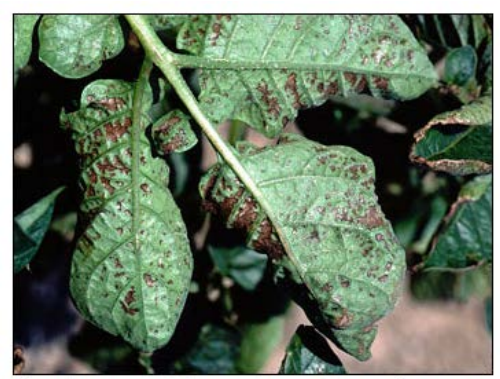
Browning on potato leaves shows evidence of exposure to high concentrations of ozone.

Plants affected by ozone will often show signs of stippling, or 'purpling' . Stippled plants will show purple dots and blemishes on the leaf's surface, but will not affect the veins of the leaf. Plants with insect damage will also demonstrate stippling, but you can differentiate the two types of damage by inspecting the veins of the leaf. Insect damaged plants will have stippling on the veins, while ozone damaged plants will not. Some plants have a higher tolerance to ozone than others; on those who are intolerant, older leaves will exhibit more stippling than younger leaves.