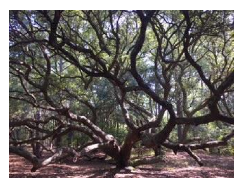
Currituck Banks Reserve