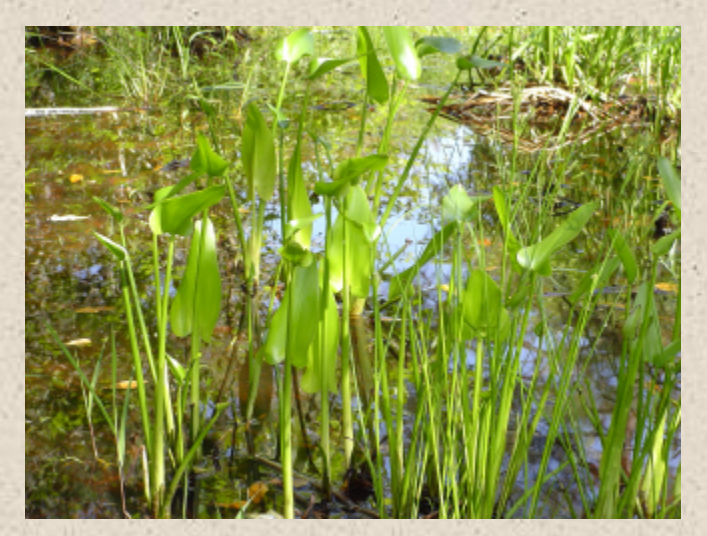
(Pickerel weed (Pontederia cordata))

Depressions within the grassland, shrub thicket or maritime forest communities may contain permanent to seasonally flooded ponds vegetated to varying degrees by marsh plants. The depressions within the Reserve are interdunal swales originally created by wind and water working and reworking deposited sediments. Where low spots intersect with the water table a pond is formed. Low spots just above the water table hold rainwater and runoff until they evaporate. The best developed freshwater marshes of the Reserve are found at the Currituck Banks site, while the other three sites contain isolated seasonally wet areas.