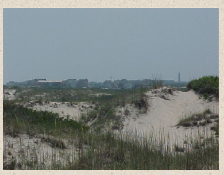
(looking south at Currituck and the Currituck lighthouse)