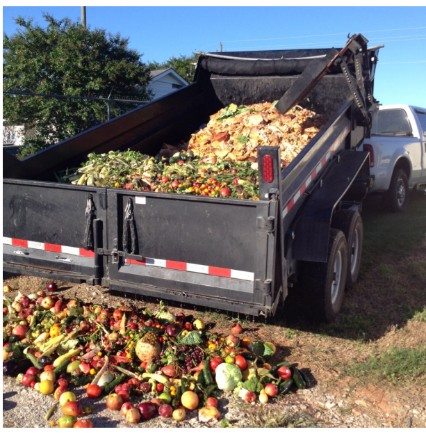
SMART Recycling has diverted over 750,000 pounds of food scraps from Raleigh-Durham area landfills through a partnership with Harris Teeter.

Following the company's mission statement "to complete the cycle of sustainability started by the farm-to-table movement by encouraging people to think about taking their food scraps from table-to-farm," SMART partners with several restaurants and permitted composting facilities around the state, including Brooks Contractor, Earth Farms, and McGill Compost.