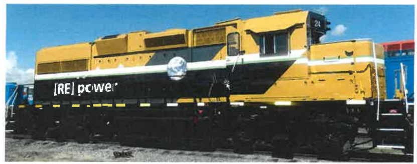
Remanufacture Switch Locomotive EMD24 to Tier 4

North Carolina has approximately 115 switcher locomotives in the State that have various reduction options available under the Eligible Mitigation Actions of Appendix D-2, section (3)(d)(1).