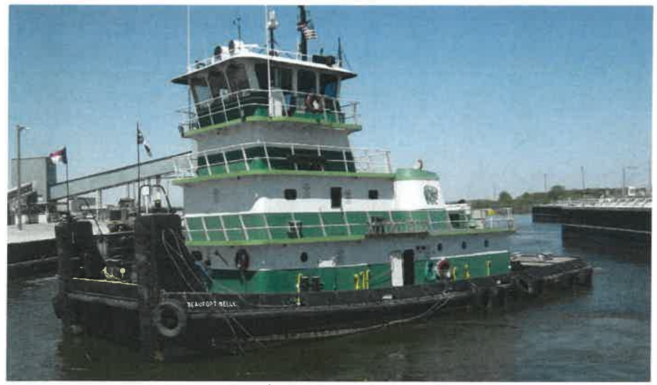
EMD 645FB 1042+ upgrade kit w/ NOx reduction Total cost effectivity: $ 1,379/Ton NOx Partial cost effectivity: $ 551/Ton NOx

Caterpillar has a very large selection of emission reduction solutions for marine under Eligible Mitigation Actions of Appendix D-2, section (4)(d)(1). Marine repowers have the best cost effectivity due to their continual rate of use. States like North Carolina are less affected by seasonal issues therefore tugs run all year.