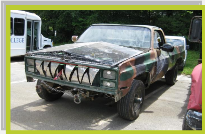
“EV” (pronounced “EE-vee”), the diesel-to-electric short haul truck. Once owned by Warren Wilson’s Forestry Crew, it now serves as an auto shop crew vehicle and educational tool.