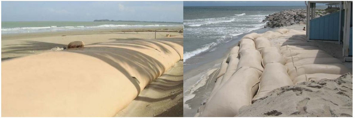
Figure 1. A single geotextile tube vs. a standard sandbag revetment.