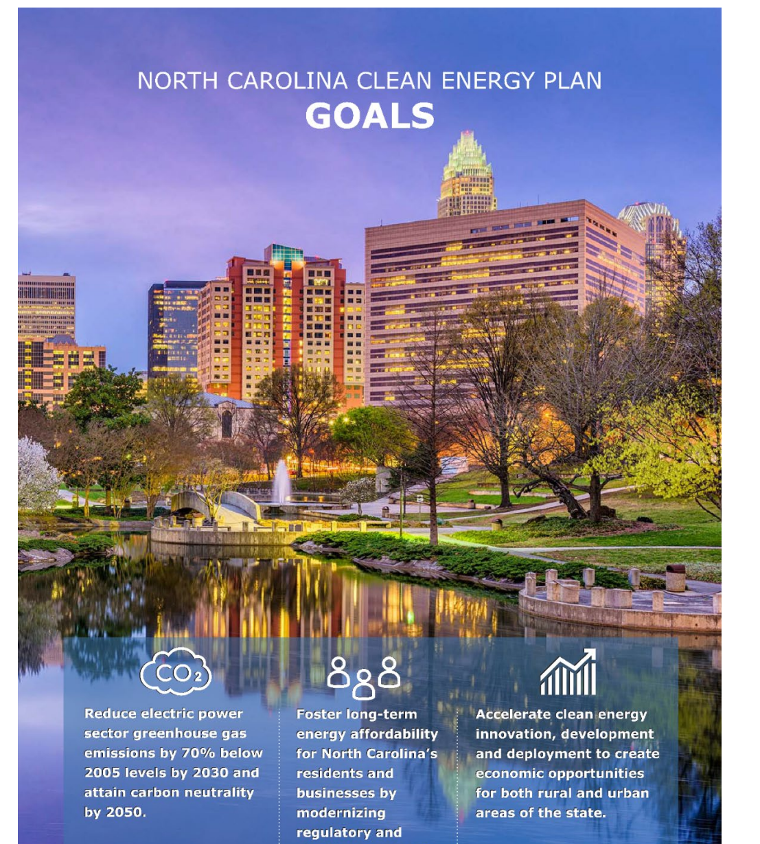
Figure 14: CEP Goals

https://deq.nc.gov/energy-climate/climate-change/nc-climate-change-interagencycouncil/climate-change-clean-energy-16