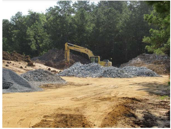
View of the stockpile(s) at the staging area