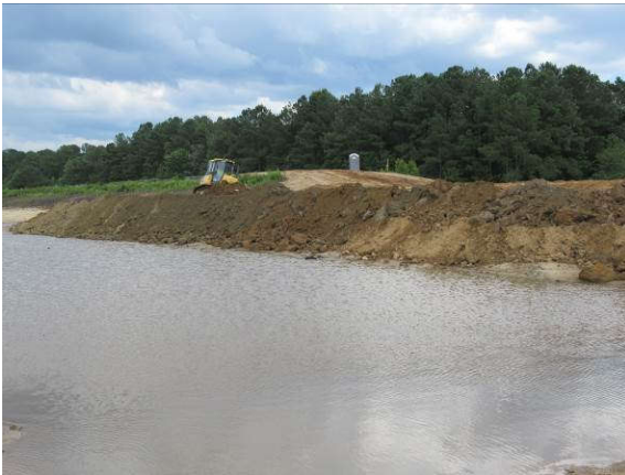
View of the upstream cofferdam from a sandbar