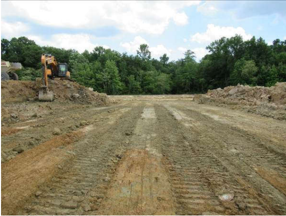
View of the excavated trench