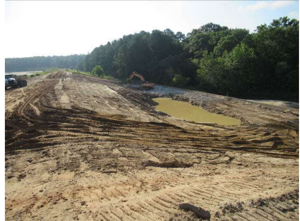
View of spillway at beginning of week