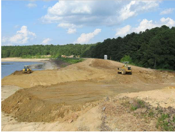
Cofferdam being raised and extended