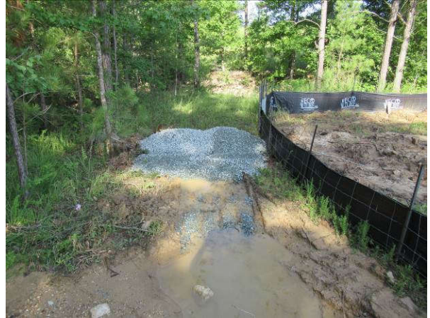
Check dam installed at outlet of pipe below access road.