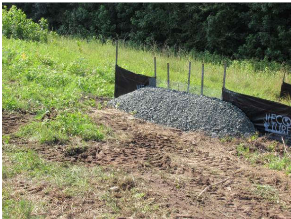
Completed stone outlets for silt fence