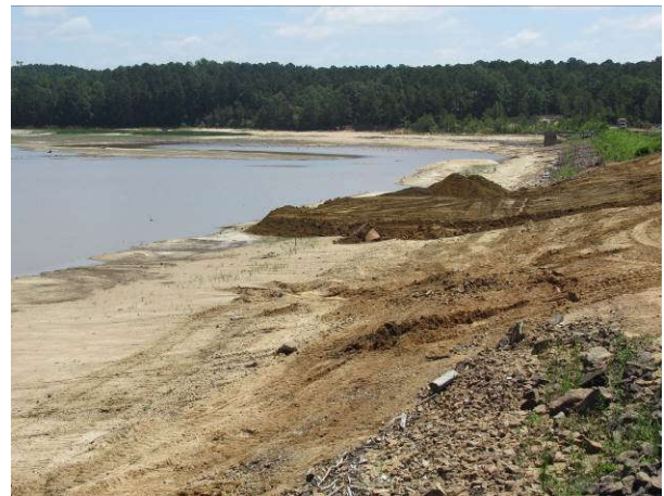
Start of construction of upstream cofferdam