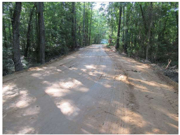
Completed access road