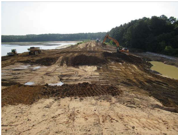
Trench being excavated into spillway