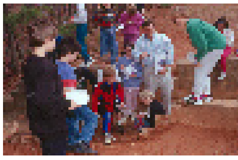
Students get out of the classroom to learn about erosion and sediment control with the Erosion Patrol.

• Erosion Patrol: This packet is designed for 3<sup>rd</sup> – 5<sup>th</sup> grade students and assists teachers in meeting and expanding upon selected objectives from the NC Standard Course of Study in communication skills, social science, and elementary science. The Patrol includes 10 activities for both classroom and field experiences as well as follow-up activities. Additional technical assistance is available upon request.