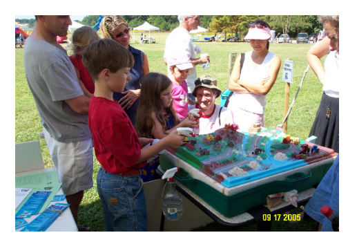
Kids and adults learn "hands-on" about sediment pollution on our lands and waters with the Enviroscape model.

Educational handouts and activities: On the Land Quality Section website, there is an order form where teachers and students may request various educational materials, including informational items, posters, activities, word searches, and more! All materials are provided free of charge. Please visit our website at: <a href="http://www.dlr.enr.state.nc.us/pages/publications.html">http://www.dlr.enr.state.nc.us/pages/publications.html</a> and look at "Educational Materials" to find our order forms and to see a complete list of what is available.