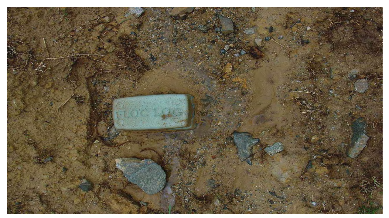
Flocculants are used to pull the finer particles out of the water to reduce turbidity, and protect sensitive water reources.

Flocculants should be used to prevent sedimentation damage to sensitive water resources such as ponds, lakes, and trout streams, or whenever turbidity control is required. Application of flocculants is very soil-type dependent.