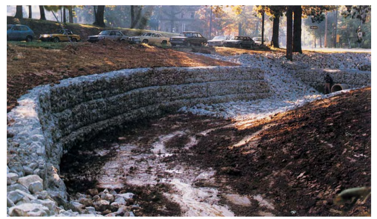
Structural streambank stabilization such as gabions and riprap is necessary where stream velocities are high and side slopes are steep.

Riprap is the most common structural method used, but other methods such as gabions, deflectors reinforced concrete, log cribbing, and grid pavers should be considered, depending on site conditions.