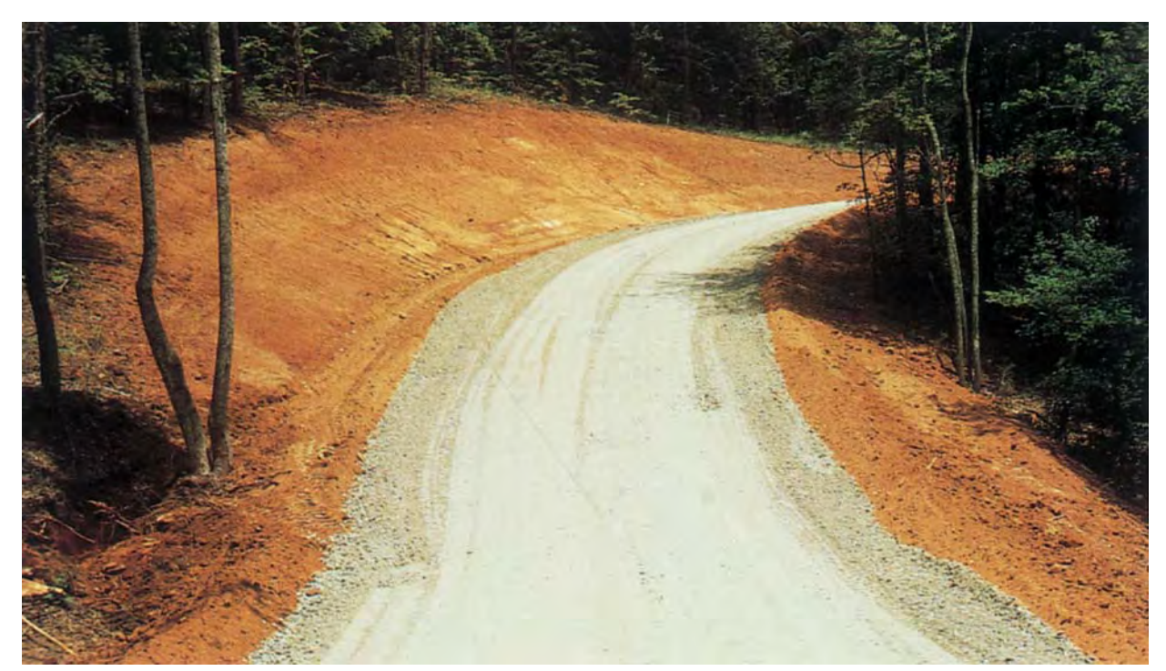
Construction road stabilization improves work efficiency and prevents erosion.

Proper grading and stabilization of construction roads and parking areas with stone often saves money for the contractor by reducing erosion, avoiding dust problems, and improving the overall efficiency of the construction operation.