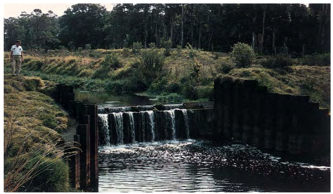
Grade stabilization structure prevents head cutting in a vegetated channel.

Maintenance of grade stabilization structures should be minimal, but it is important that inspections be made periodically and after all major storms through the life of the structure.