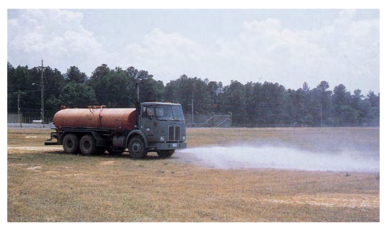
Dust control by watering provides immediate protection, but water must be applied periodically throughout dry periods (source: SCS).

Maintain dust control measures properly through dry weather periods until all disturbed areas have been permanently stabilized.