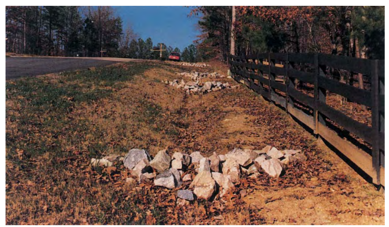
Check dams slow velocity of flow in temporary, low-flow channels.

Check dams are temporary expedient practices to reduce channel erosion until permanent stabilization measures can be installed. Inspect the dams weekly and after significant rainfall events.