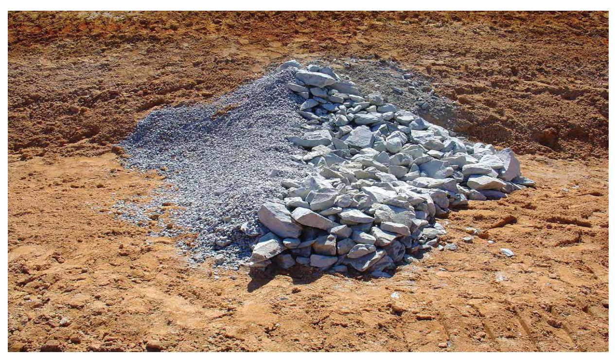
Check dams with weirs control the velocity of runoff through channels and reduce erosion.

Riprap and wash stone are the most common materials for this practice. The weir length varies due to the drainage area. The center of the check dam should always be at least 9 inches lower than the outer edges at natural ground level. Frequent inspections are required.