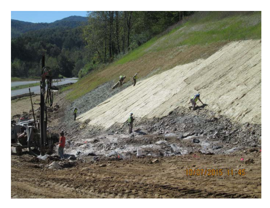
Slope Stabilization Efforts Underway

This is part of a 0.711 mile project with a budget of $15,939,043.11. This project was approximately 80-85% complete at the time of inspection. The approved plan appeared to be adequate and was properly implemented. Minor field adjustments were made to the plan and one major change to the plan was approved through the hydraulic unit. One comment noted was that drainage areas needed to be checked for the additional traps/basins added during construction. It appeared that some may have a drainage area greater than 1 acre; if so, those basins must be designed with top dewatering. Maintenance was needed in several areas. Overall the disturbed areas were adequately maintained and the recordkeeping (self-inspections and Roadside Environmental Unit inspection reports) for this project was good.