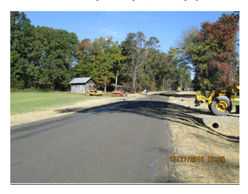
Phased Construction on a Road Maintenance Project, Guilford County

This is a 1.6 mile maintenance project with a budget of $650,000.00, which was approximately 90% complete at the time of inspection. This project was a good example of phased construction done properly – one section was cleared and grubbed, graded, and stabilized prior to the next section being opened up. The site was originally a dirt road which was being upgraded to a paved road. The plan was adequate and properly implemented; minor field adjustments had been made to the plan to add additional measures where needed. In many areas, DOT had enough right of way (60 feet) that the existing ditchline did not have to be disturbed. Recordkeeping (self-inspections and Roadside Environmental Unit inspection reports) for this project was excellent.