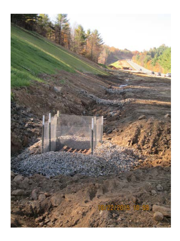
Measures in ditchline, left Stabilization of slopes, below

This is a 4.08 mile project with a budget of $21,371,178.20, and is part of an overall larger project (approximately 16 miles total). The project was approximately 20-25% complete at the time of inspection. The plan was adequate and had generally been implemented well; however, there were several areas of the project which needed maintenance. In addition, additional construction entrance/exits were needed in a couple of locations. This project did have a trout buffer variance, and the streams onsite appeared to be well protected. Recordkeeping (self-inspections and Roadside Environmental Unit inspection reports) for this project was adequate.