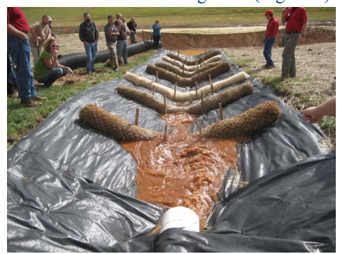
Figure 1. Wattles installed with PAM.

In October, 76 practitioners gathered at the Mountain Horticultural Crops Research Station in Mills River NC. In November, another 87 participants attended the workshop in Raleigh, where presentations were given at the Brownstone Hotel with a field trip on day two to NC State University's Lake Wheeler Research Station. In the classroom, participants learned from NC DENR staff and other experts about regulations, such as the Proposed Falls Lake Rules and trout buffer disturbances, stormwater best management practices, and land stabilization practices, such as the use of regionally appropriate vegetative cover and chemical applications such as polyacrylamides (PAM). On day two of each workshop, participants were guided in the field by Melanie McCaleb and Rich McLaughlin of NC State University's Department of Soil Science. They were given hands-on demonstrations on the use of PAM for sediment control using a variety of passive and active dosing treatments. Fiber check dams, a passive approach to dosing, were used along the newly constructed demonstration site at the Mountain Horticulture Site to show the effects of PAM on turbidity control (Figure 1). PAM was also used in conjunction with different types of ground cover applications to demonstrate the ability to reduce erosion and sediment loading rates (Figure 2).