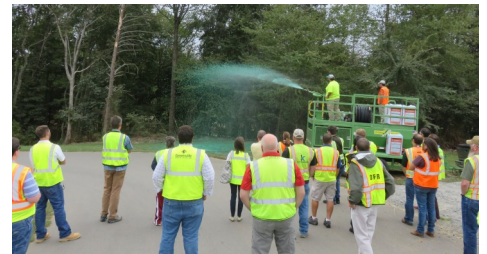
Hickory Workshop: Hydro mulch application demonstration during the Profile Products tour

H ickory Workshop. The first NC E&SC Design workshop of 2019 was held on October 8th at the Hickory Metro Convention Center in Hickory, NC. There were 110 people in attendance at this workshop where 10 presentations on various E&SC topics were given. Workshop participants also had the opportunity to attend a HECP manufacturing plant