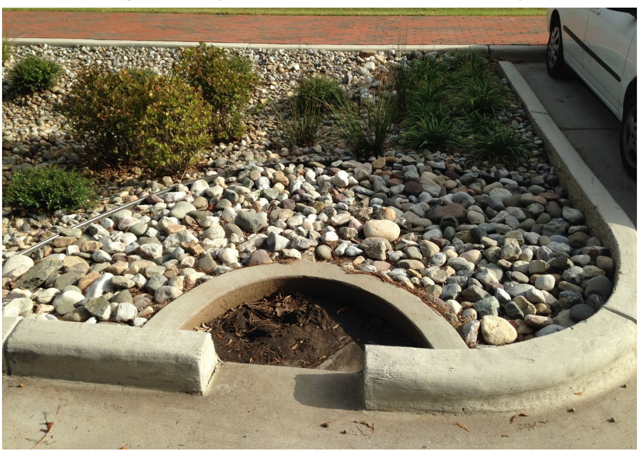
Figure 4: Example of Concrete-Lined Bioretention Forebay