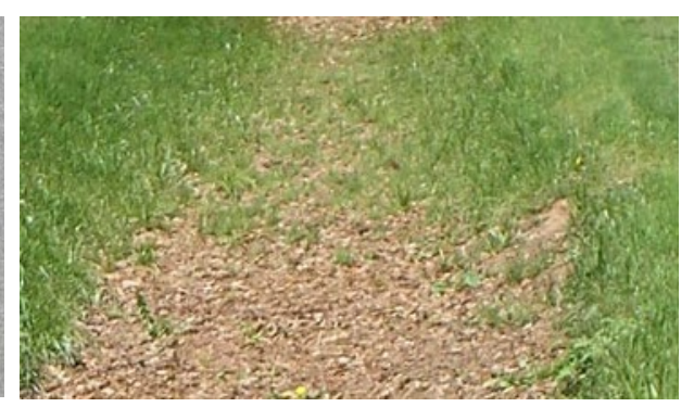
Replace mulch when it becomes thin or is taken over by grass. Manually or mechanically remove grass – do not spray herbicide!