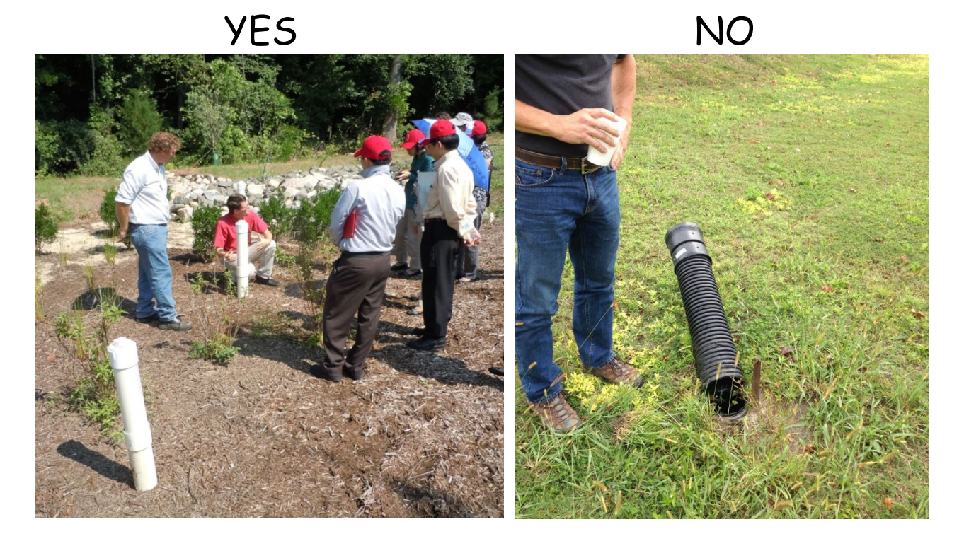
Figure 3: Bioretention Clean-Out Pipes

In Figure 3, the clean-out pipe on the left shows a properly installed clean-out pipe. The clean-out pipe on the right is a poor design, it is easy to break and when it does, the stormwater will leave the bioretention cell via the pipe rather than passing through the plants and media as intended.