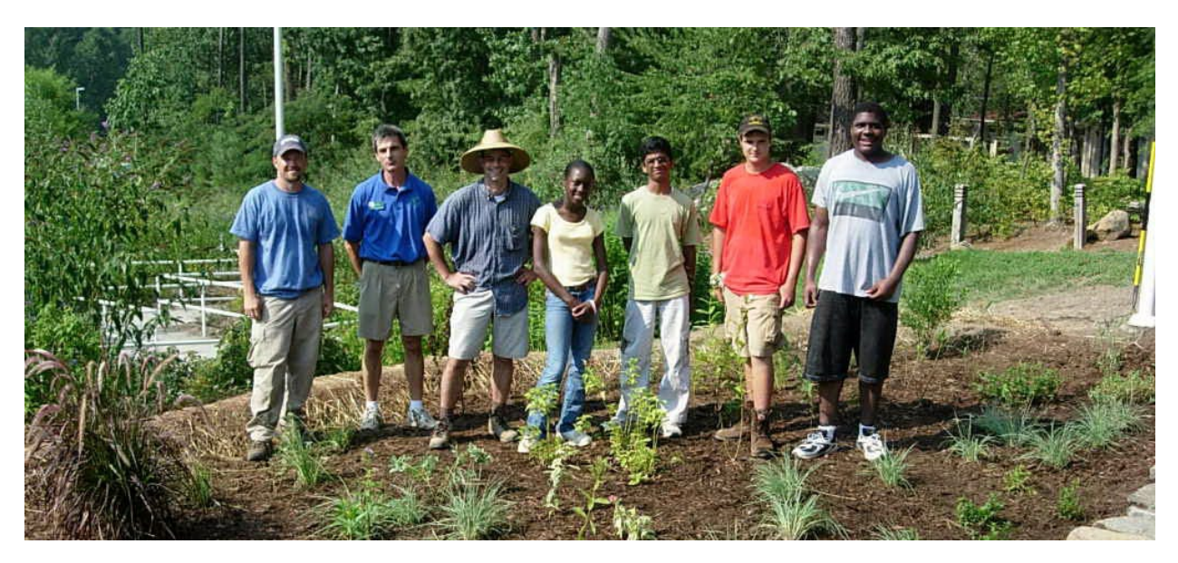
Street Side Project