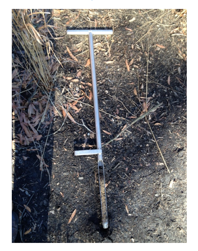
Figure 5: Soil Probe Showing a Profile of Bioretention Cell Media

problem, more extensive rebuilding is required. If the bed has filter fabric installed under the media and above the washed rock, the filter fabric may be clogged with sediment. If clogged filter fabric is present, the bed will need to be rebuilt.