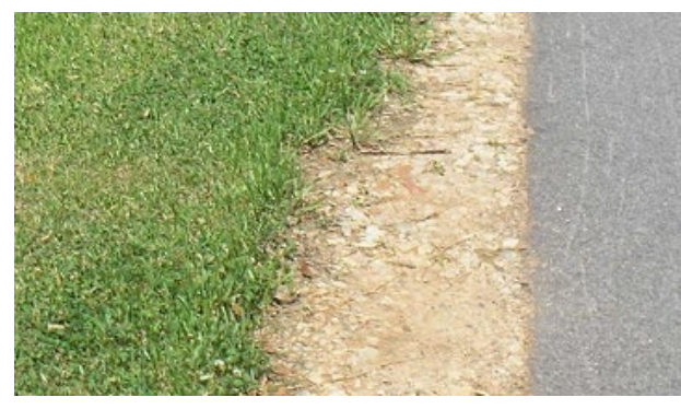
Replace gravel when it has become clogged with sediment