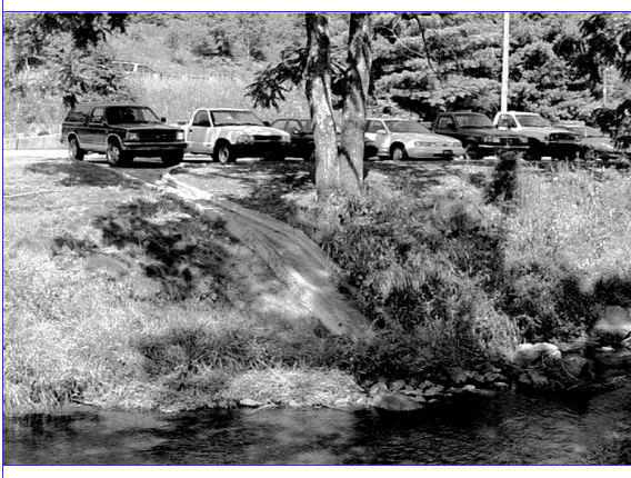
A poorly designed parking area can reduce the effectiveness of watershed planning in your community!

All built upon areas within water supply watersheds must address stormwater runoff. Projects that are built in accordance with the "low density" approach do not require structural controls, such as wet detention basins. For projects that are constructed under an approved "high density" ordinance, structural controls are required. Projects built utilizing the 10/70 provisions must utilize best management practices and direct stormwater runoff away from surface waters. Structural controls are required for communities that use the 10/70 option as part of an approved high density development ordinance.