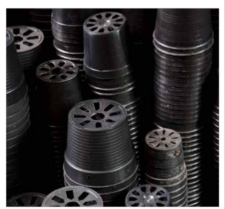
North Carolina's Recycling Business Development Grant Program provided a total of $60,000 this year to two ag plastic recycling companies to help them collect and process more material.

Verity Recycling, meanwhile, received a $30,000 grant from RBAC to purchase a box truck to increase collection of plastic pots and film produced by small-scale nurseries. Previously, Verity had been unable to serve smaller nurseries that do not produce truckload quantities. With the new vehicle, Verity is able to efficiently collect plastic waste from multiple nurseries in one trip. This allows the company to expand its customer base and increase the volume of agricultural plastics recycled.