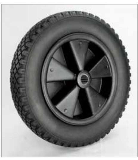
Roll-Tech Molding Products uses a variety of post-consumer and post-industrial materials to manufacture wheel and other items. It received nearly $17,000 in grant funding.