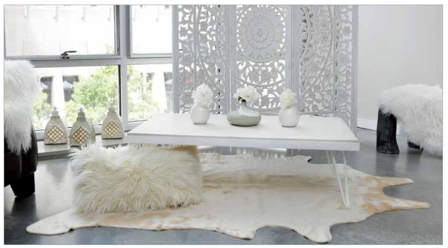
Furniture maker HighCube recovers expanded polystyrene from a range of sources to make tables and other products.