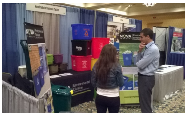
Conference participants visit one of 100 vendors exhibiting at the Carolina Recycling Association 25 th Annual Trade Show and Conference exhibit hall.

Daily breakout sessions featured diverse topics ranging from organics and electronics to recycling markets and recycling education. Each breakout session was moderated and presented by professionals on the front line of recycling issues in North and South Carolina.