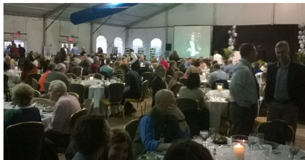
Representatives from across the industry celebrate 25 years of recycling in the Carolinas at the Gala and Awards Dinner.

The highlight of the conference was 25 th Anniversary Gala and Awards Dinner which ended with a champagne toast. During the celebration, founding members of the Carolina Recycling Association reflected on the history of the organization and told the stories of how CRA became the organization that it is today.