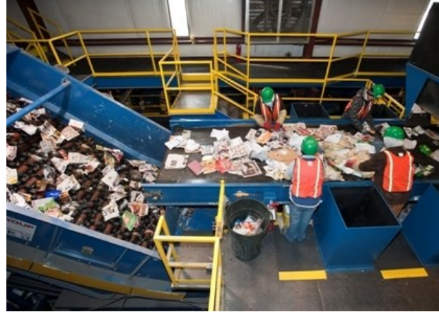
Line workers at the Charlotte Sonoco MRF work to separate contaminants from recyclable commodities.

Recycling contamination is a costly, time consuming and sometimes dangerous problem for North Carolina materials recovering facilities, or MRFs. While the majority of contamination comes from residential collection, haulers and processors of recycled material also contribute to the issue throughout the materials stream. By targeting the problem from the collection and handling sides of material generation, improvements in quality, safety and market value can be achieved at North Carolina MRFs.