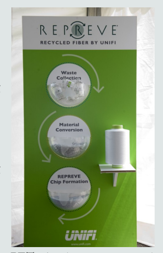
PET bottles are ground, processed into chips, and then processed into yarn.

Additional processes enhance the texture of REPREVE yarn giving it essential bulk, crimp and strength properties. Texturing provides essential properties to fabric like stretch, comfort and softness. Fabric mills use REPREVE fibers to manufacture a wide variety of products such as clothing, upholstery, tote bags and banners.