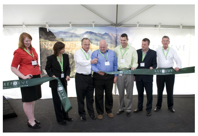
Unifi and federal government officials, along with the editor and publisher of EcoTextile News, cut the ribbon at the grand opening in May 2011.

An Energy Recovery Kit that captures and reutilizes heat in the production of REPREVE chip