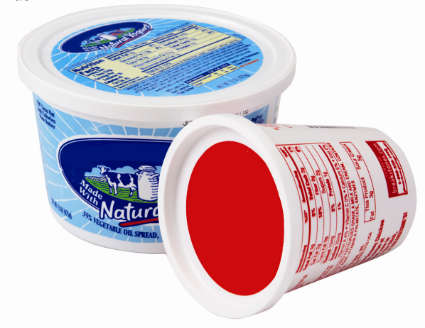
Examples of "tubs and lids" include yogurt, margarine, butter and sour cream tubs with lids or tops.*

The ever-expanding variety of new and creative types of plastic packaging can create collection and recovery difficulties for community recycling programs and material recovery facilities (MRFs). The Association of Postconsumer Plastics Recyclers (APR) is working to ease those concerns with the establishment of new model bale specifications for the collection of "bulky rigid plastics" and "tubs and lids."