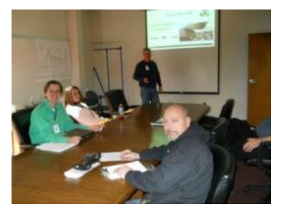
Training for all – contractors, custodians, managers, shop floor, etc.

Partnerships for higher rebates and lower costs.