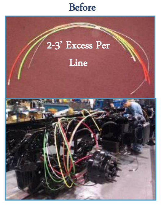
Excess pulled to allow hoses to reach cab connections

Build eco into Six Sigma and Continuous Improvement Events.