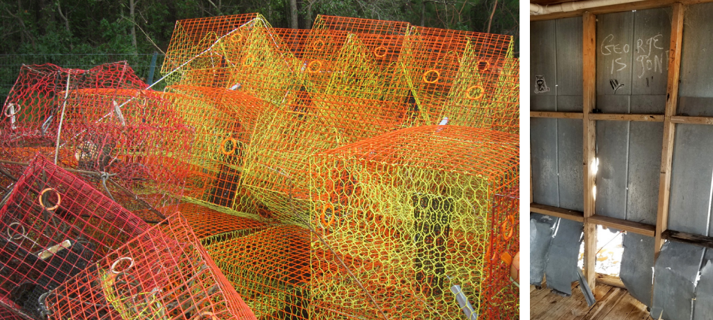
Crab traps waiting for the return of cleaner waters.

Hurricane Florence estimated damages to North Carolina shellfish aquaculture operations.