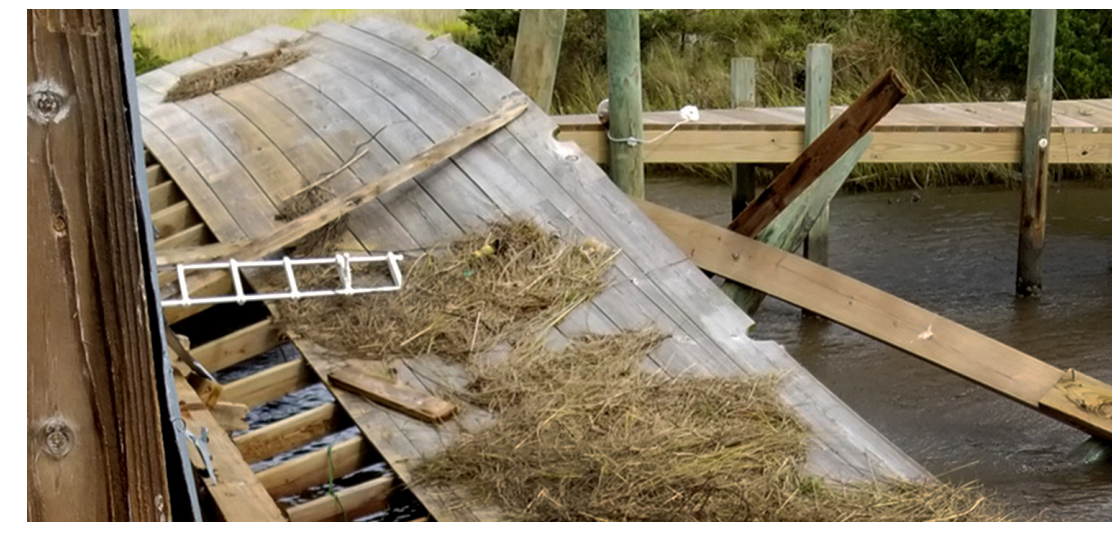
Damaged docks in Sea Level, North Carolina.

The bait and tackle businesses and forhire operations in North Carolina had combined revenues of $248 million and employed 4,700 workers in 2017.