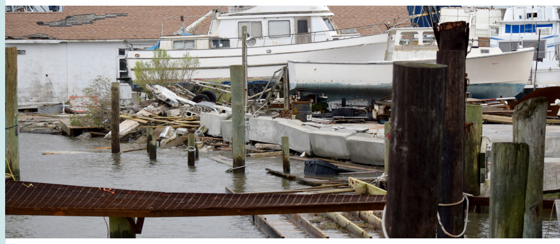
Damaged vessels and docks in Beaufort, North Carolina.