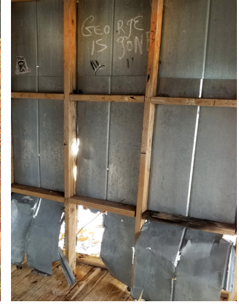
Fish house damage in Sea Level, North Carolina.