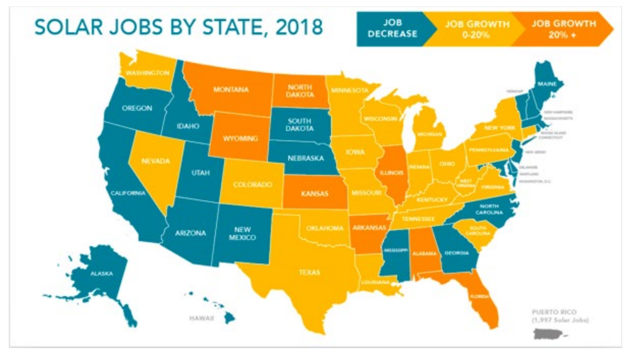
Figure 5:Solar Job Growth by State