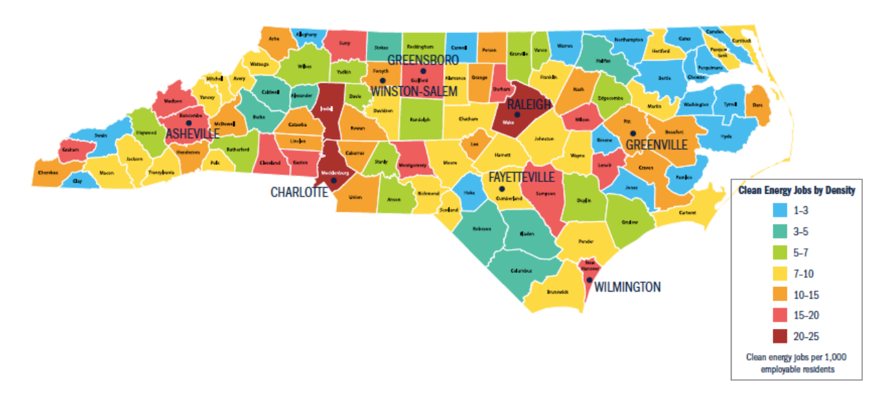
Figure 2: NC Clean Energy by County and Density

Clean energy has produced jobs across the state, contributing employment and revenues to both rural and urban counties. According to the Clean Jobs NC report, every single county in NC is home to clean energy jobs and 26 counties have at least 900 clean energy jobs as shown in Figure 2. <sup>45</sup> Per the report, rural areas account for 25% of clean energy jobs in NC with a total of 29,000 jobs in renewable energy, energy efficiency, storage, clean vehicles and clean fuels, while the urban areas of Charlotte and Raleigh combined have 37,700 clean energy jobs. <sup>46</sup> It should be recognized that while these statistics are modeled from USEER data, it may be difficult to pinpoint jobs at the county level; however the report shows strong evidence that clean energy jobs are being created in rural NC clusters and as a whole across the state.