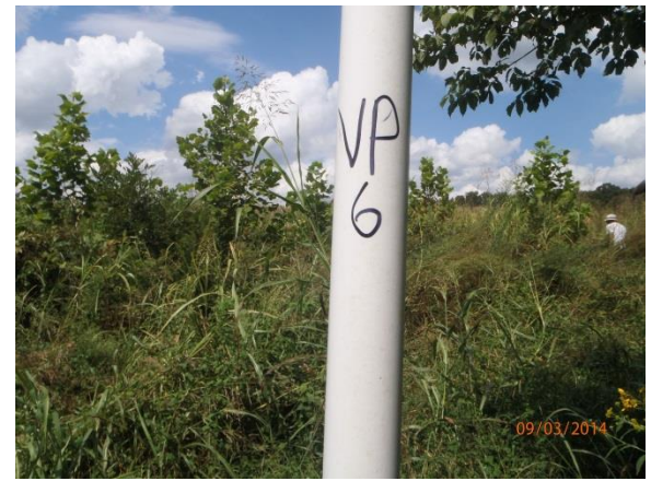
Vegetation Plot 6