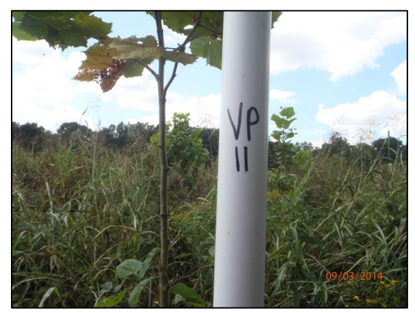
Vegetation Plot 11