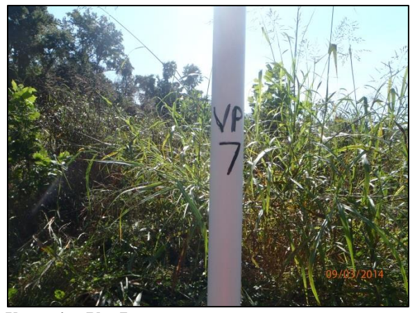
Vegetation Plot 7