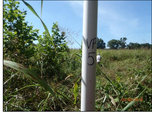
Vegetation Plot 5