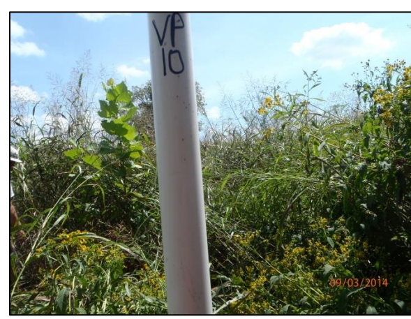
Vegetation Plot 10