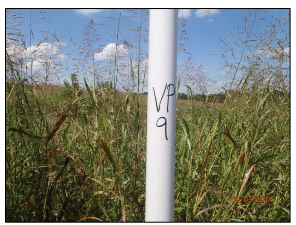
Vegetation Plot 9