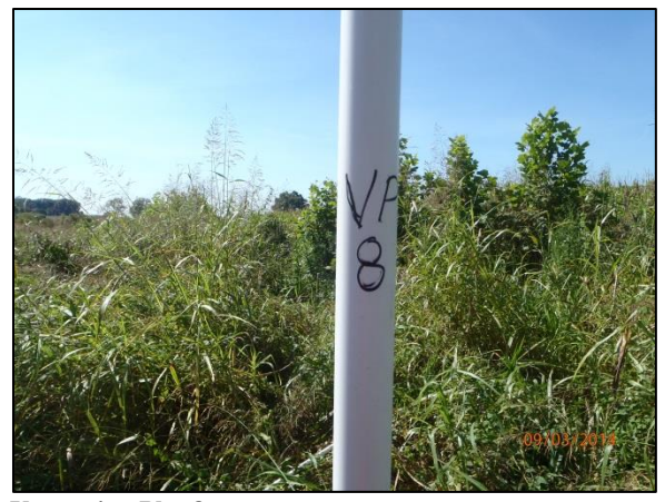
Vegetation Plot 8