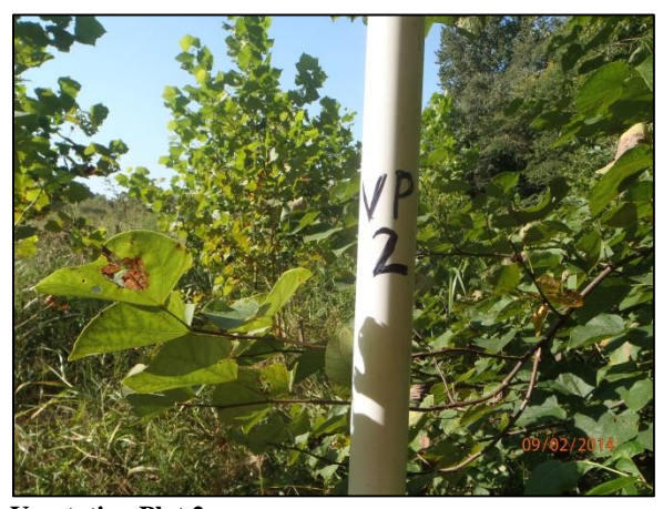
Vegetation Plot 2