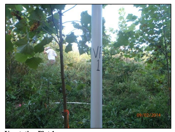
Vegetation Plot 1