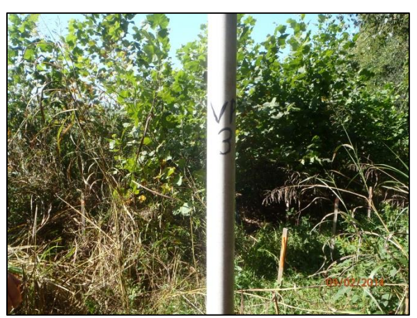
Vegetation Plot 3