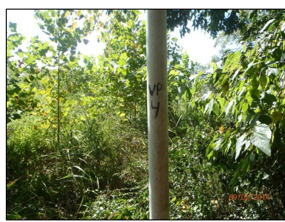
Vegetation Plot 4