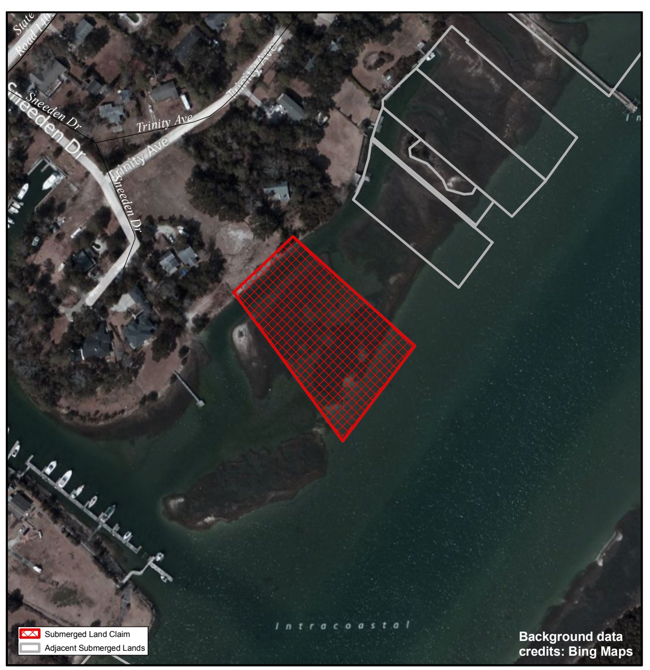
Disclaimer: This map is not a certified land survey and is not intended to comply with North Carolina GS § 47-30. It is prepared for informational purposes only and is not to be used for legal descriptions or property transfers. North Carolina Division of Marine Fisheries makes no warranty, expressed or implied, concerning the accuracy, completeness, reliability of these data, and users are advised that use of this map is at their own risk.