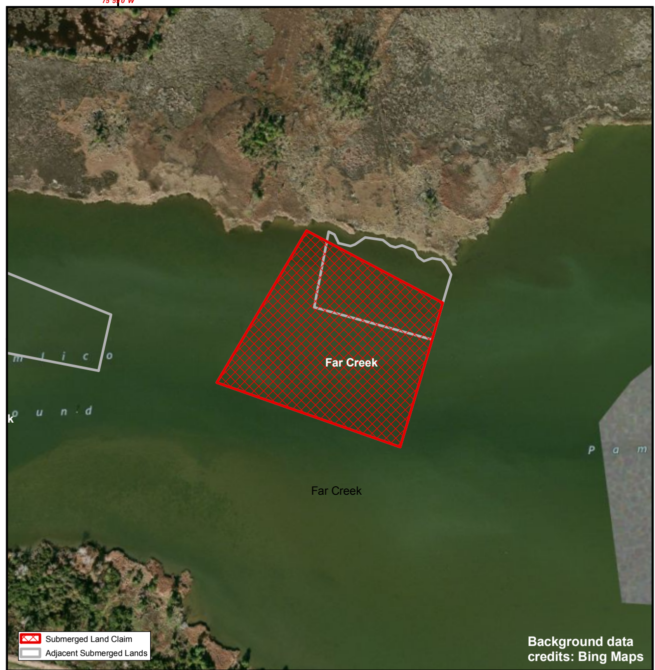
Disclaimer: This map is not a certified land survey and is not intended to comply with North Carolina GS § 47-30. It is prepared for informational purposes only and is not to be used for legal descriptions or property transfers. North Carolina Division of Marine Fisheries makes no warranty, expressed or implied, concerning the accuracy, completeness, reliability of these data, and users are advised that use of this map is at their own risk.