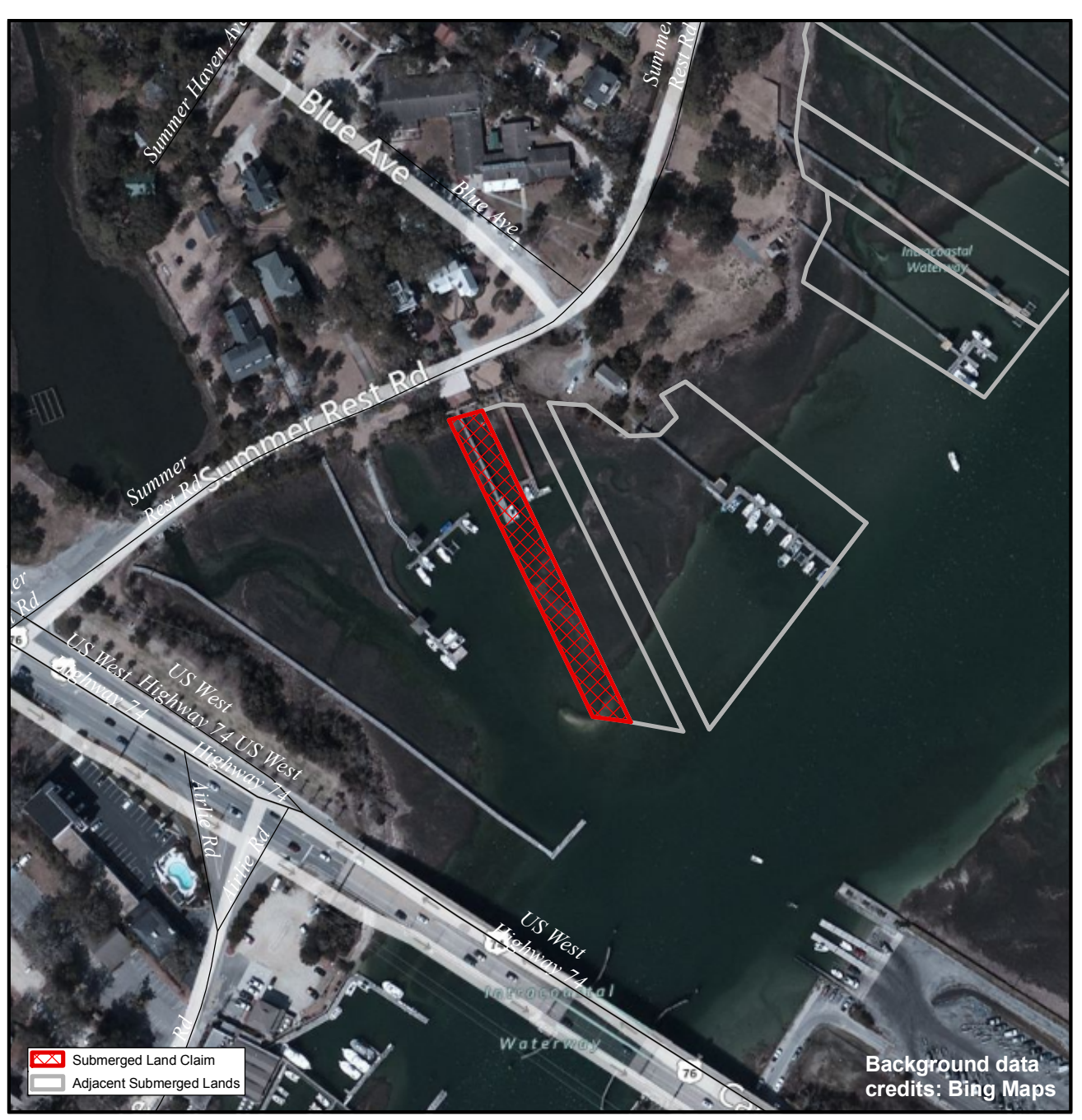
Disclaimer: This map is not a certified land survey and is not intended to comply with North Carolina GS § 47-30. It is prepared for informational purposes only and is not to be used for legal descriptions or property transfers. North Carolina Division of Marine Fisheries makes no warranty, expressed or implied, concerning the accuracy, completeness, reliability of these data, and users are advised that use of this map is at their own risk.