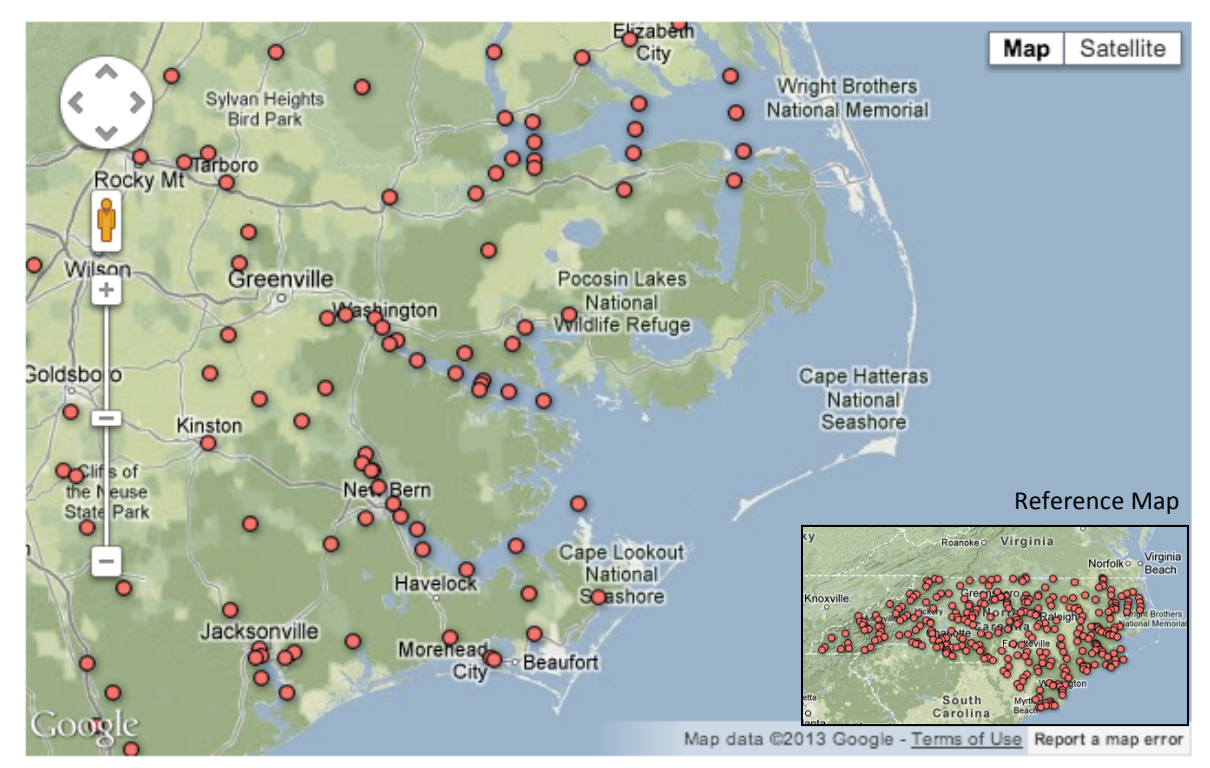
Ambient Monitoring Stations in Albemarle-Pamlico estuarine system.

The Albemarle Sound Pilot for the National Monitoring Network study of the Albemarle Sound shows that consistent monitoring is important in gauging the health of estuaries and in determining the causes of disconcerting trends. However, there is minimal long term monitoring in our state's estuaries. The Albemarle-Pamlico system is the second largest estuarine system in the United States. However, of the 323 ambient monitoring stations in the state, only a handful of ambient monitoring stations are within the estuarine system (see map below). Bogue, Back, Core, Croatan, Currituck, and Roanoke Sounds do not currently posses ambient monitoring stations according to Albemarle-Pamlico National Estuary Program.