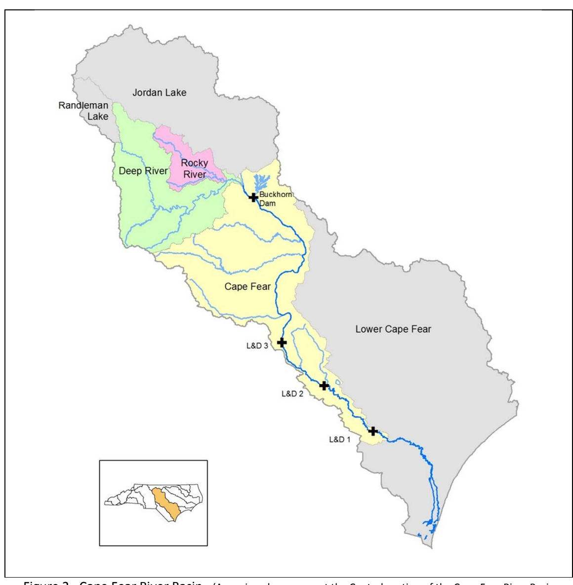
Figure 2. Cape Fear River Basin. (Areas in color represent the Central portion of the Cape Fear River Basin for which nutrient criteria are proposed)

Notes: The subwatersheds in gray either have nutrient management plans (i.e. Jordan Lake, and Randleman Lake) or are areas that have streams draining to the portion of the Cape Fear River downstream of Lock and Dam 1 (i.e. Lower Cape Fear). Thus, the areas in gray are not in the area designated as the Central portion of the Cape Fear River. The subwatersheds in color are either listed as impaired for chlorophyll-a or are of concern for nutrient over enrichment and comprise the "central portion of the Cape Fear River basin."