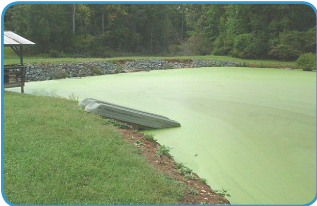
Duckweed on a pond