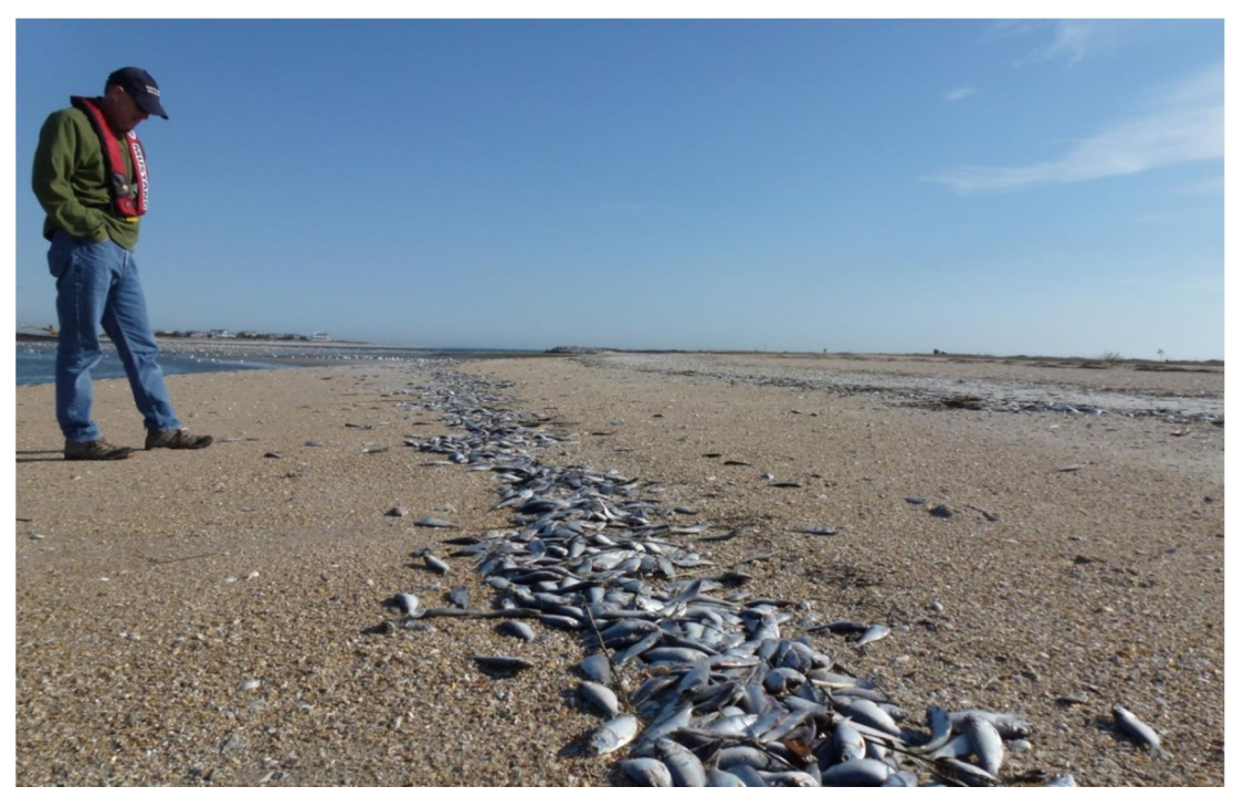
Fish kill behind Masonboro Island, January, 2013.

North Carolina Department of Environment and Natural Resources Division of Water Resources Raleigh, NC