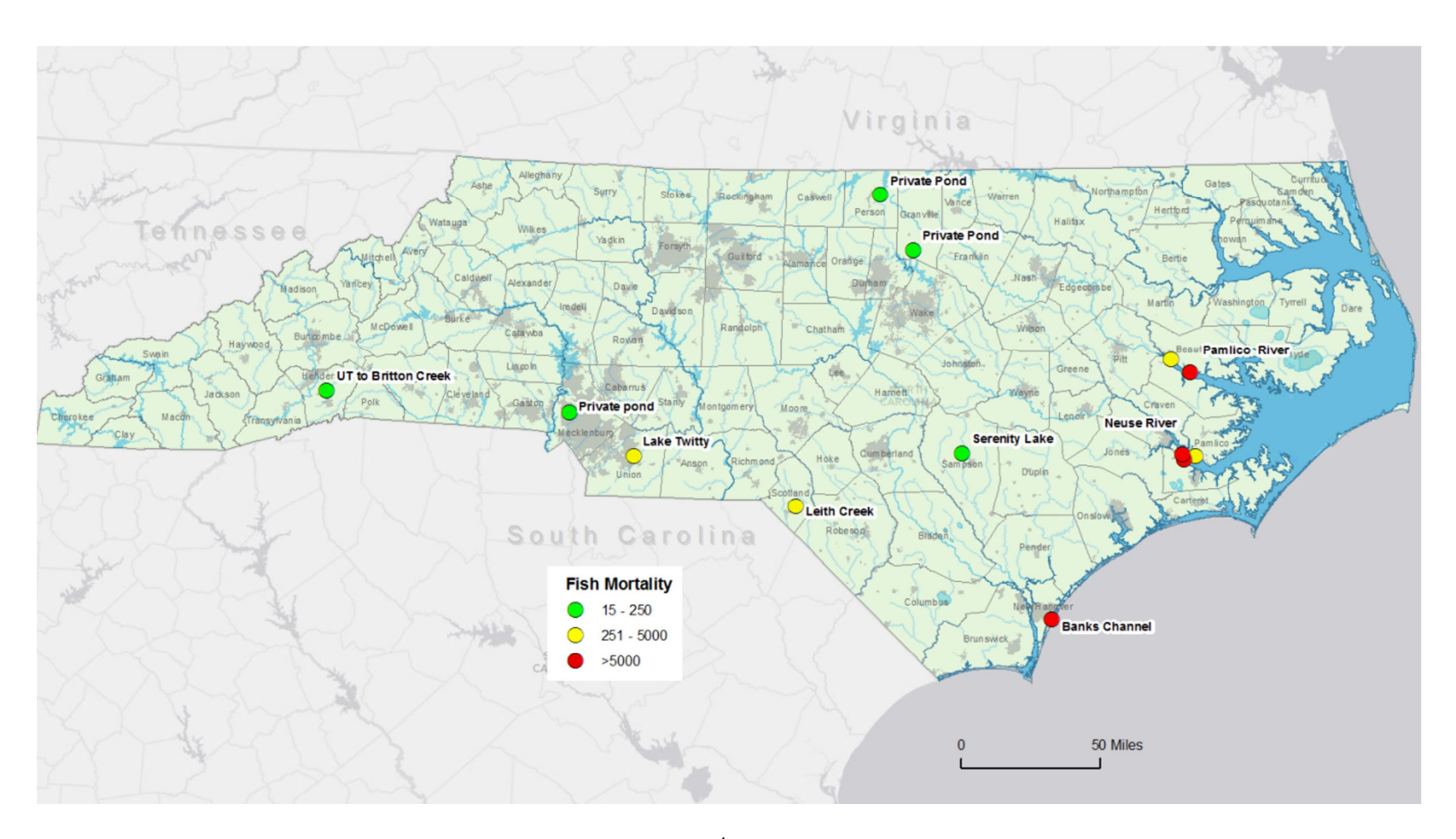
Figure 1: Fish kill events and observed mortality reported to NCDWR during 2013