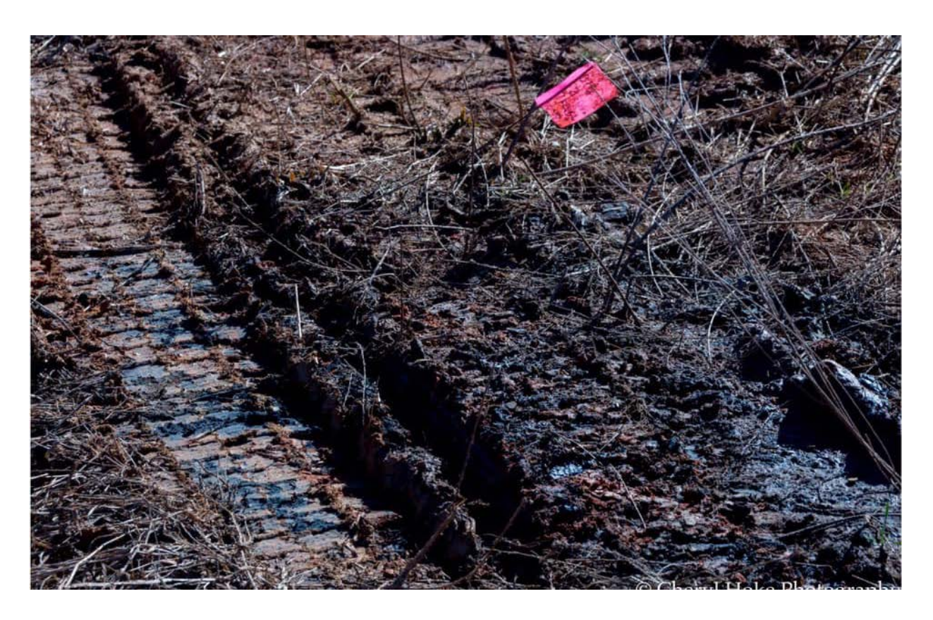
Maureen Scott McCrary Road off 150 near Marshall Steam Plant Mooresville NC