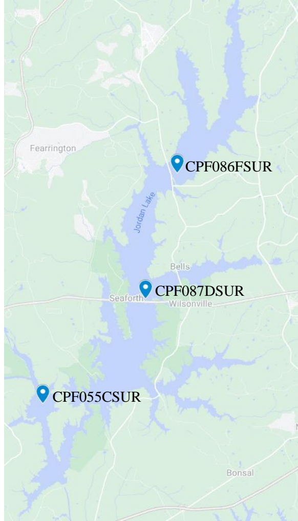
Figure 2. Graph showing total PFAS concentration.